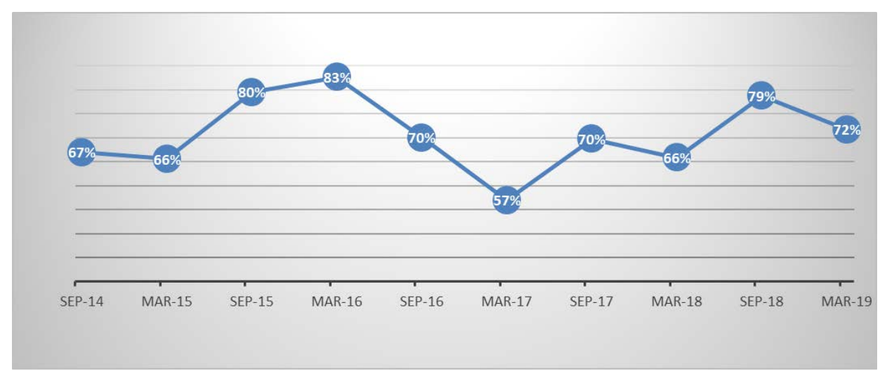
FIGURE 1. PERCENTAGE OF SINGLE AUDITS THAT MET FEDERAL REPORTING REQUIREMENTS