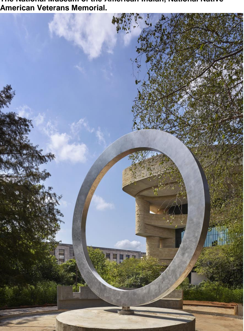
The National Museum of the American Indian, National Native American Veterans Memorial.

The Office of Investigations complies with guidelines established by the U.S. Attorney General. On February 27, 2015, the Government Publishing Office OIG completed a peer review of the Smithsonian OIG investigative program based on the Quality Assessment Review Guidelines for Investigative Operations of Federal Offices of Inspector General. The Smithsonian received the highest peer review rating. Our next investigative peer review is scheduled for spring 2022.