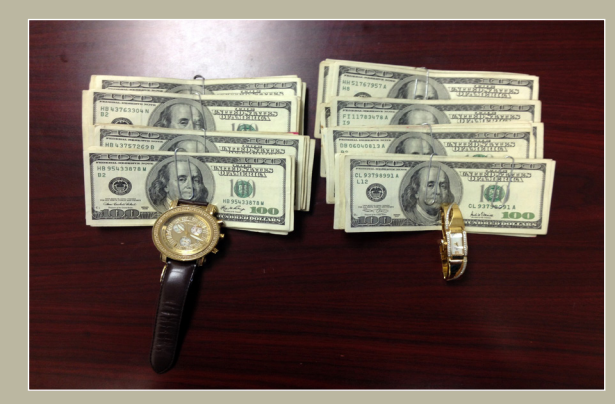
Kentucky postmaster admitted to accepting cash from customers for money order purchases.