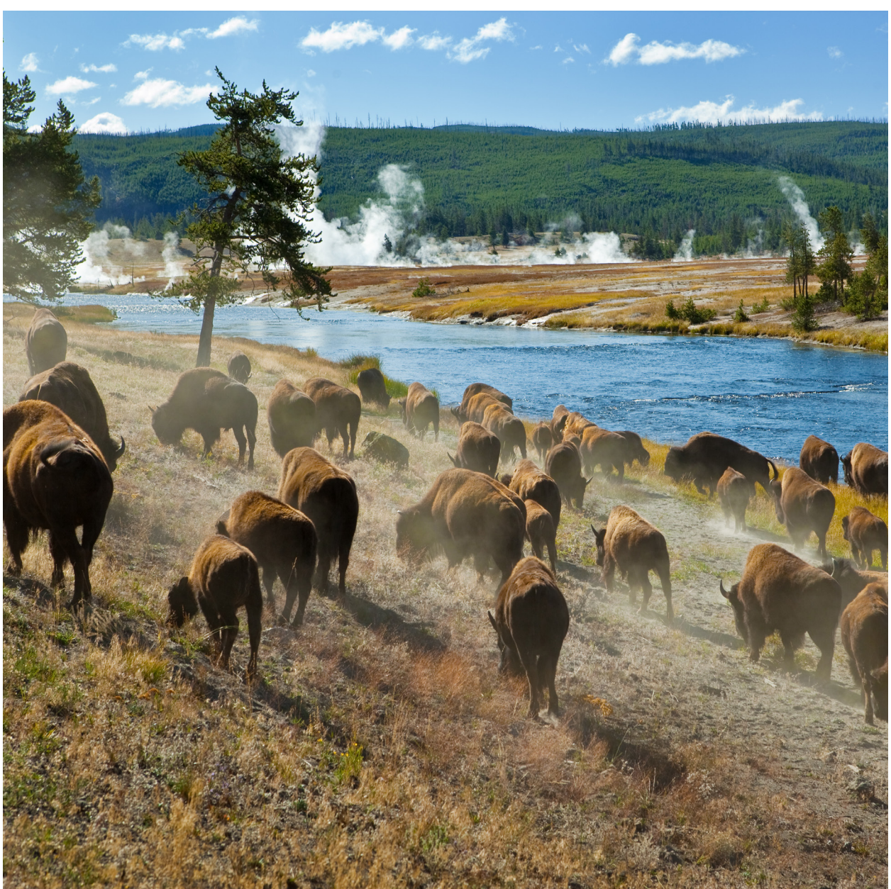
A herd of bison move along the Firehole River in Yellowstone National Park in Wyoming.

During our inspection, we also learned that DOI began revising its policies on lockup facilities. The revisions require independent staff not involved with jail operations to perform annual inspections of the facilities, detention officers' posts to be adjacent to inmate living areas so the officers can immediately respond to emergencies, and bureaus to annually certify compliance with the requirements and update their standard operating procedures as necessary. We believe that implementation of our recommendations, coupled with these revisions, will improve operations at NPS lockup facilities.