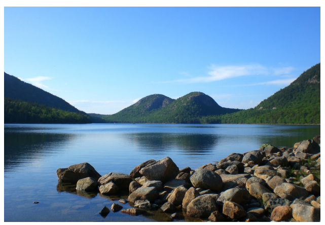
Looking toward the Bubbles from the shore of Jordan Pond in Acadia National Park in Maine.

In this semiannual report, I am pleased to submit a summary highlighting the Office of Inspector General's successful work covering the 6-month period from October 1, 2014, through March 31, 2015. To promote excellence, integrity, and accountability within the programs, operations, and management of the U.S. Department of the Interior, our audit and investigative work focused on high-priority areas like energy, Indian affairs, revenue enhancement, public safety and security, bribery and corruption, theft of Government funds, false statements, and wildland firefighting.