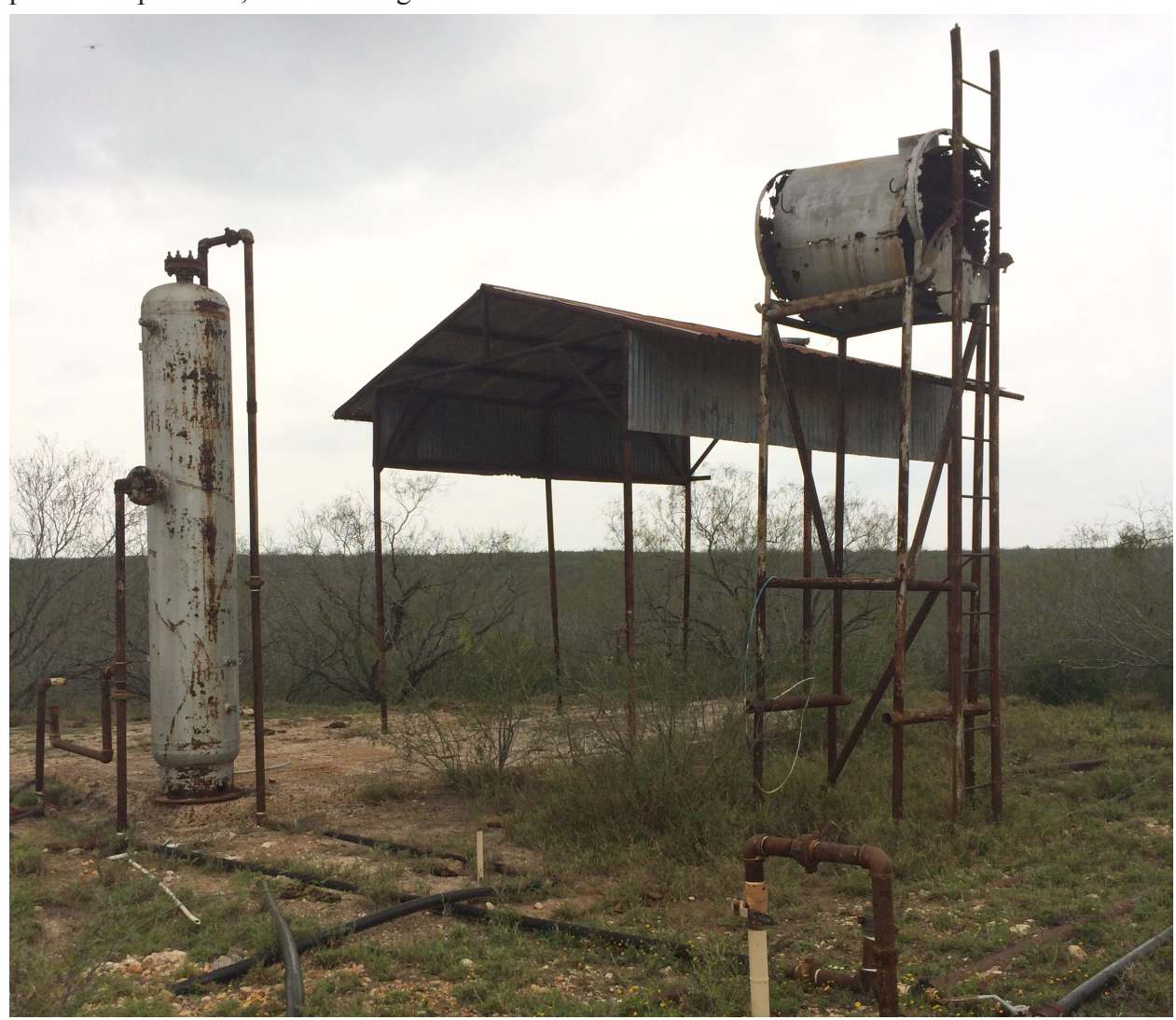
Abandoned well infrastructure on national wildlife refuge land.

On many of these refuges, FWS acquired only the surface rights to the land, and the mineral estate remained in private or State ownership. Under these circumstances, the mineral estate owner may conduct oil and gas exploration and development. There are approximately 5,000 wells associated with oil and gas exploration and development on more than 200 refuges and wetland management districts. Two-thirds of these wells are either inactive or their status is unknown to FWS. In addition, approximately 1,275 miles of transmission pipelines cross refuge lands, transporting a variety of petroleum products, including crude oil, refined petroleum products, and natural gas.