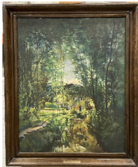
"Copy of Daubigny's Landscape" by Roland Livingstone