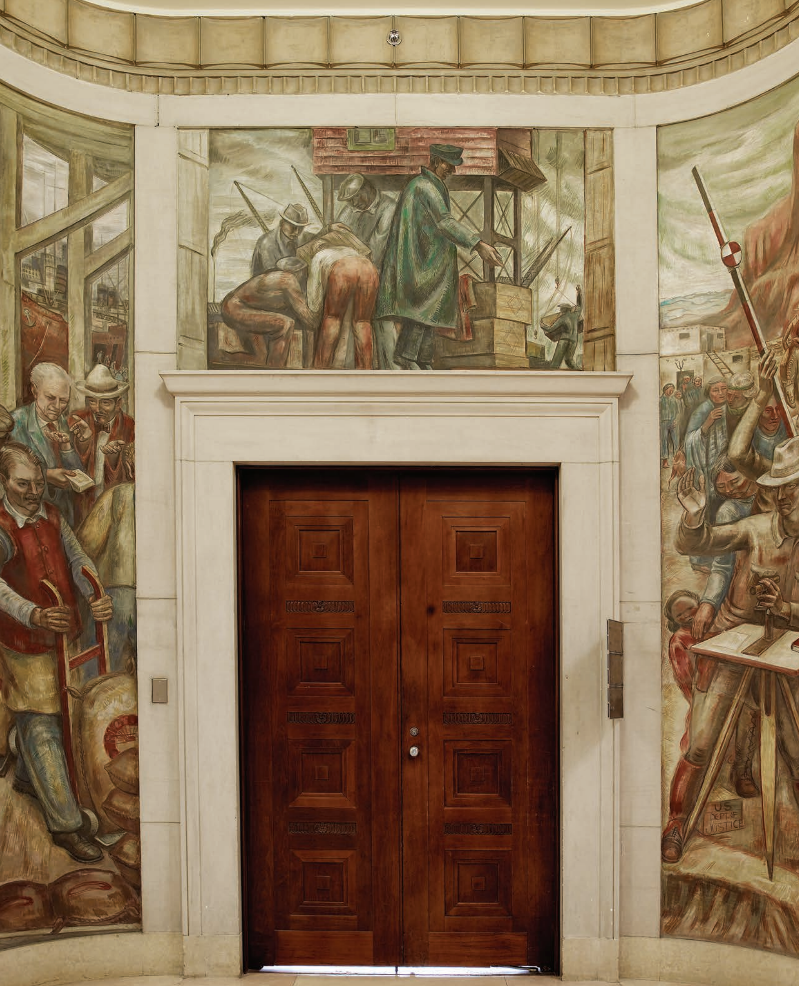
Photo: Fresco paintings surrounding doorway to room 5138, Department of Justice, Washington, D.C.