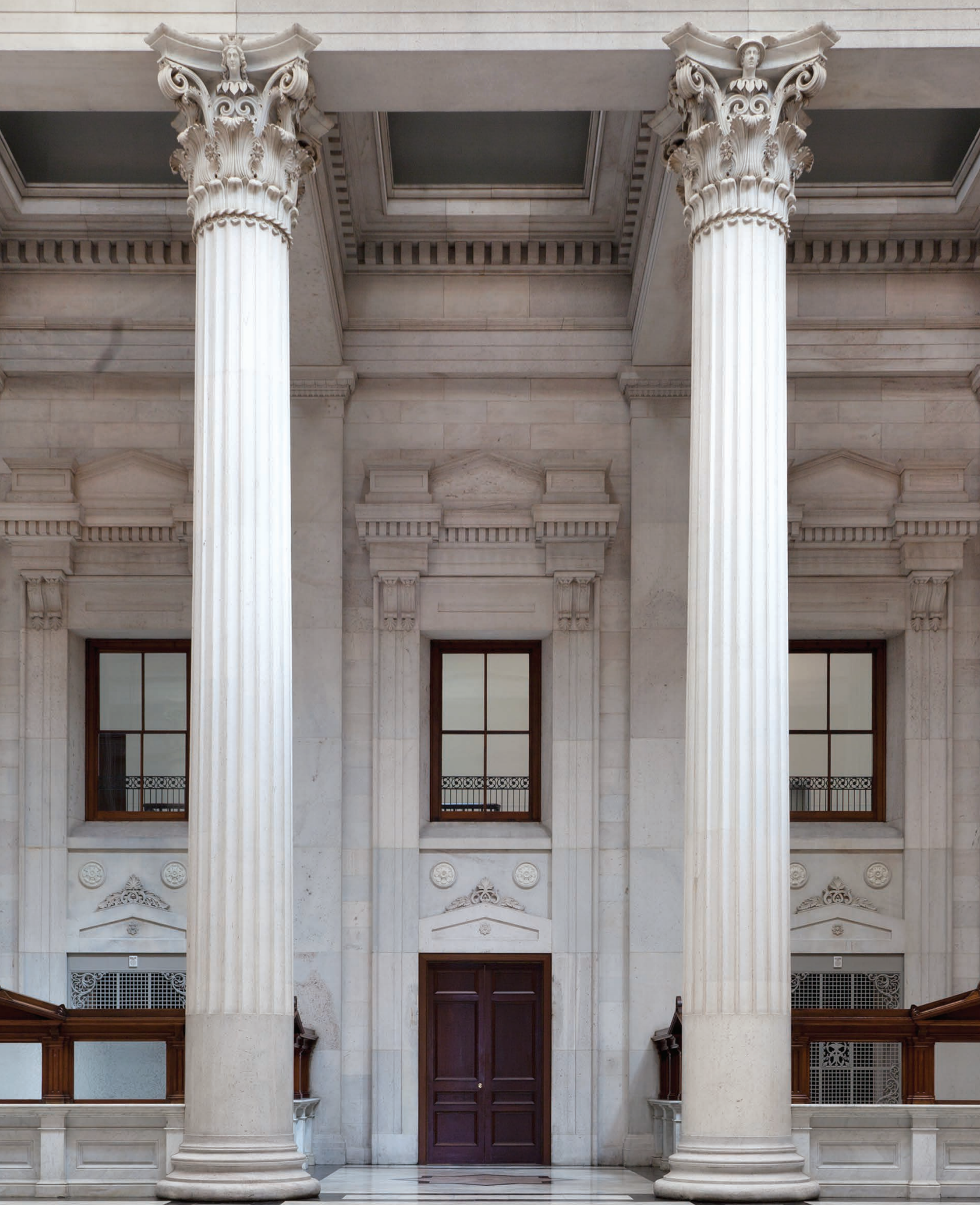
Photo: U.S. Custom House in New Orleans, Louisiana