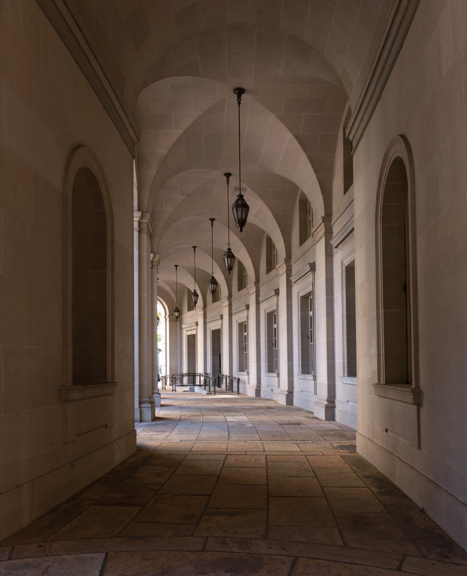
Photo: The Internal Revenue Service Building, located in Washington, D.C.