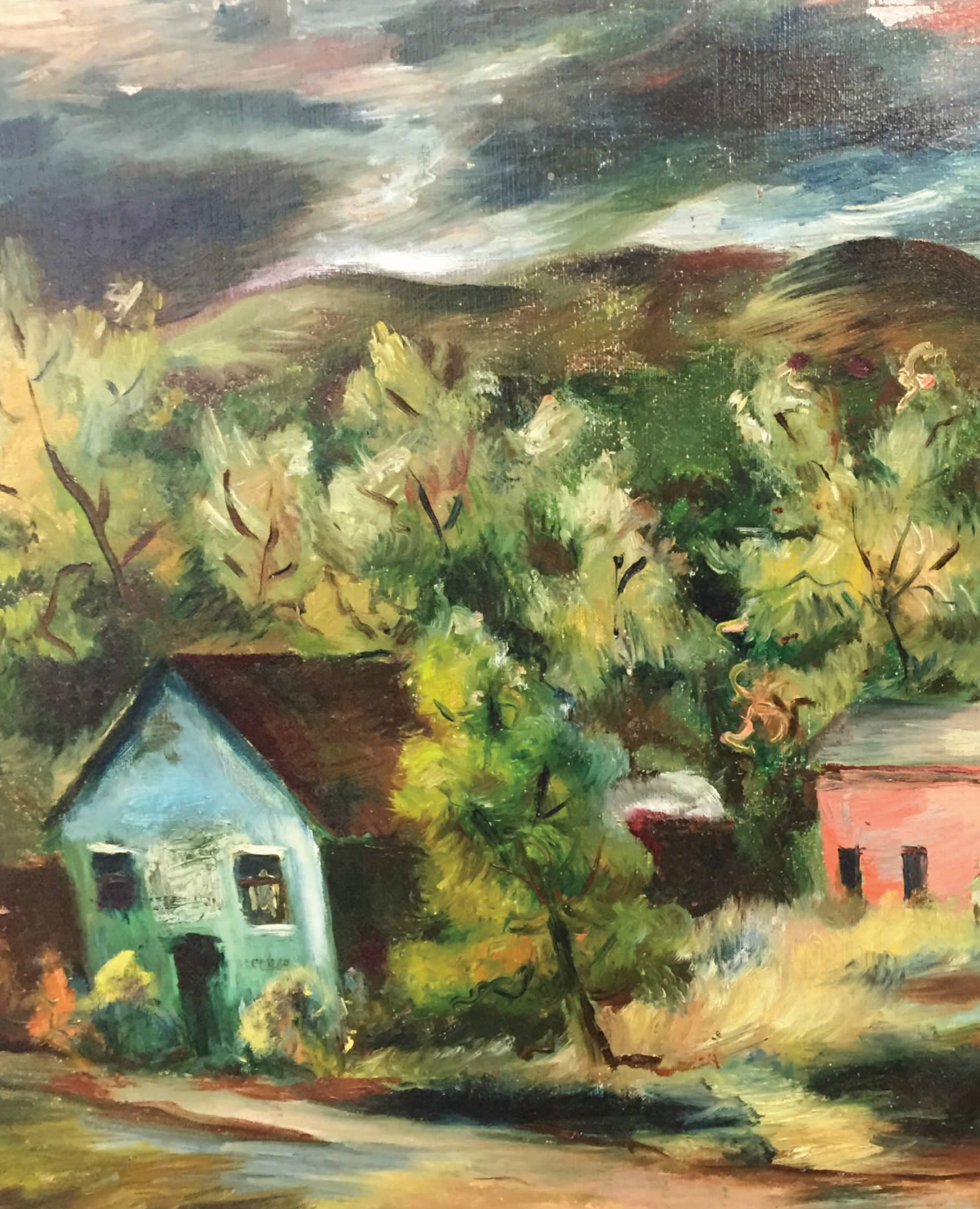
Photo: Detail of recovered WPA painting "Landscape" by Theodore Polos