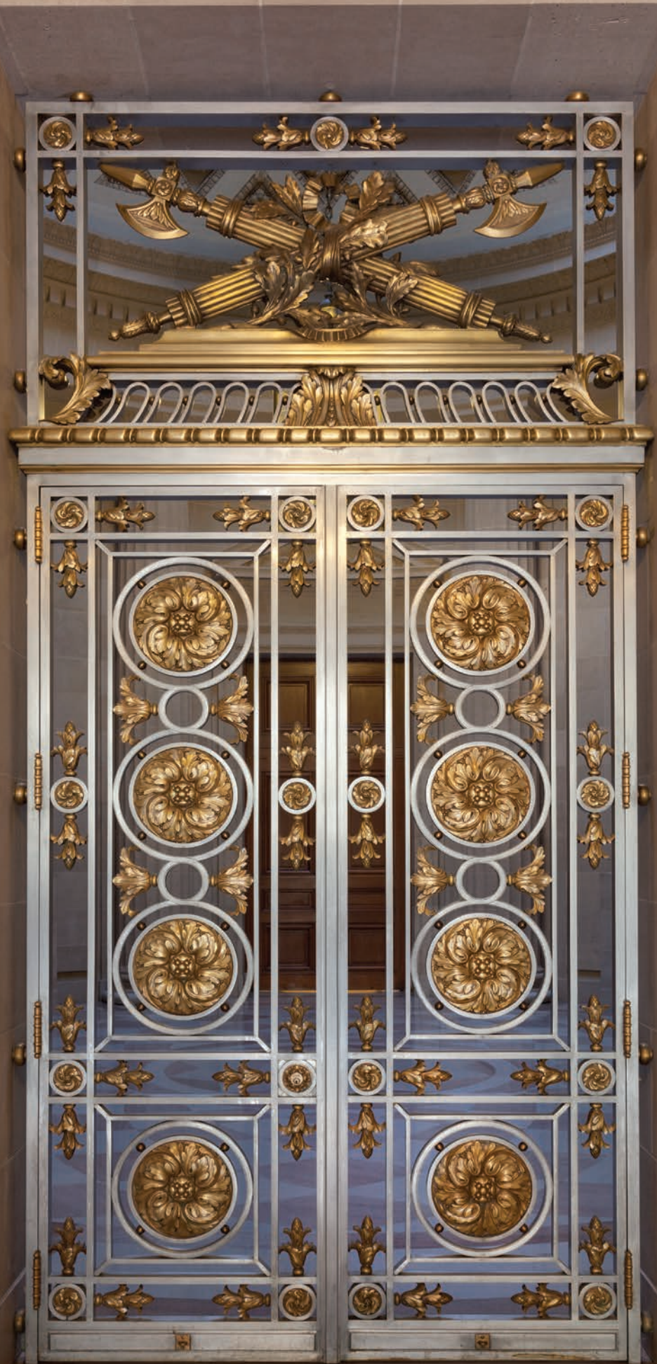
Photo: East lobby decorative door, EPA East and West, located on 12th and Constitution Avenue, N.W., Washington, D.C.