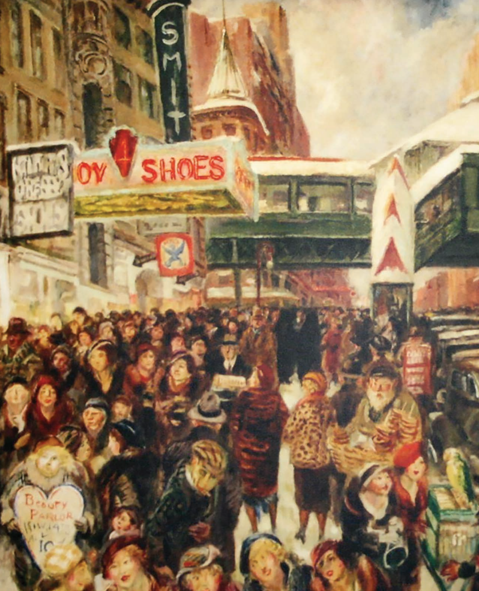
Photo: Detail of recovered WPA painting "Fourteenth Street at Sixth Avenue" by John Sloan