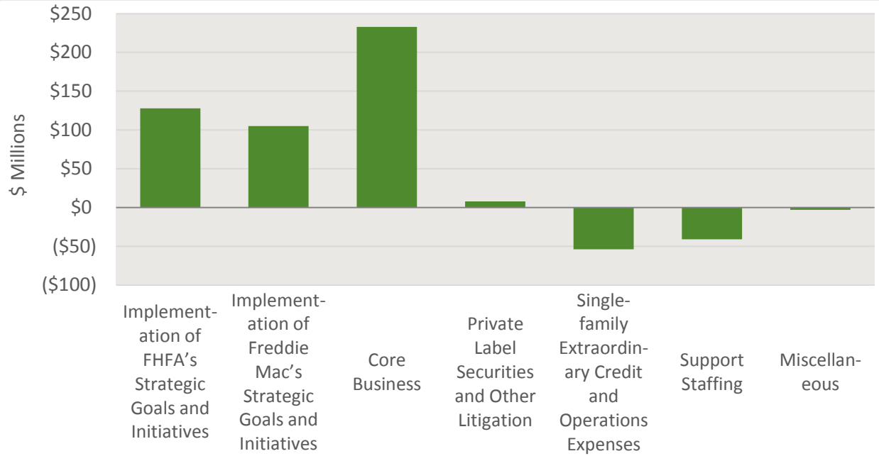
FIGURE 2. FREDDIE MAC SUMMARY OF DRIVERS IN NET INCREASES OF EXPENSES DURING REVIEW PERIOD