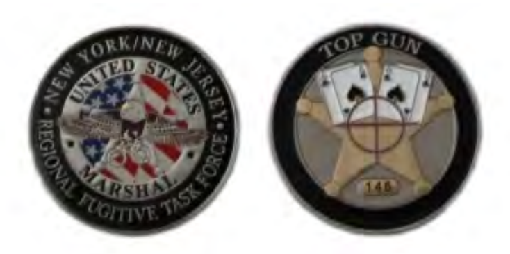
Photo 4: NY/NJ RFTF "Top Gun" Challenge Coin

During the period of time examined by the OIG, the NY/NJ RFTF also participated in the Federal and Local Cops Organized Nationally (FALCON) and Fugitive Safe Surrender programs, in which the NY/NJ RFTF worked with local law enforcement officers and civilian volunteers to help fugitives surrender and clear their warrants at non-threatening locations, such as churches. The NY/NJ RFTF supervised 9 of these programs between 2005 and 2010. Erickson told us that the majority of people involved in the programs are non-USMS individuals and included, among other things, volunteers from social services agencies and local law enforcement agencies. He stated further that as part of the program, the NY/NJ RFTF provided pins to the volunteers so that the participants would recognize volunteers and to thank people for their support.