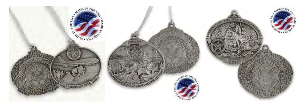
Photo 2: 2008, 2009 and 2010 USMS Christmas Ornaments

Beginning in approximately 2008 and continuing into 2010, IOD management authorized the purchase with appropriated funds of 1,679 USMS-themed Christmas ornaments.<sup>40</sup> The ornaments cost a total of $13,605.95, an average cost of $8.10 per ornament.