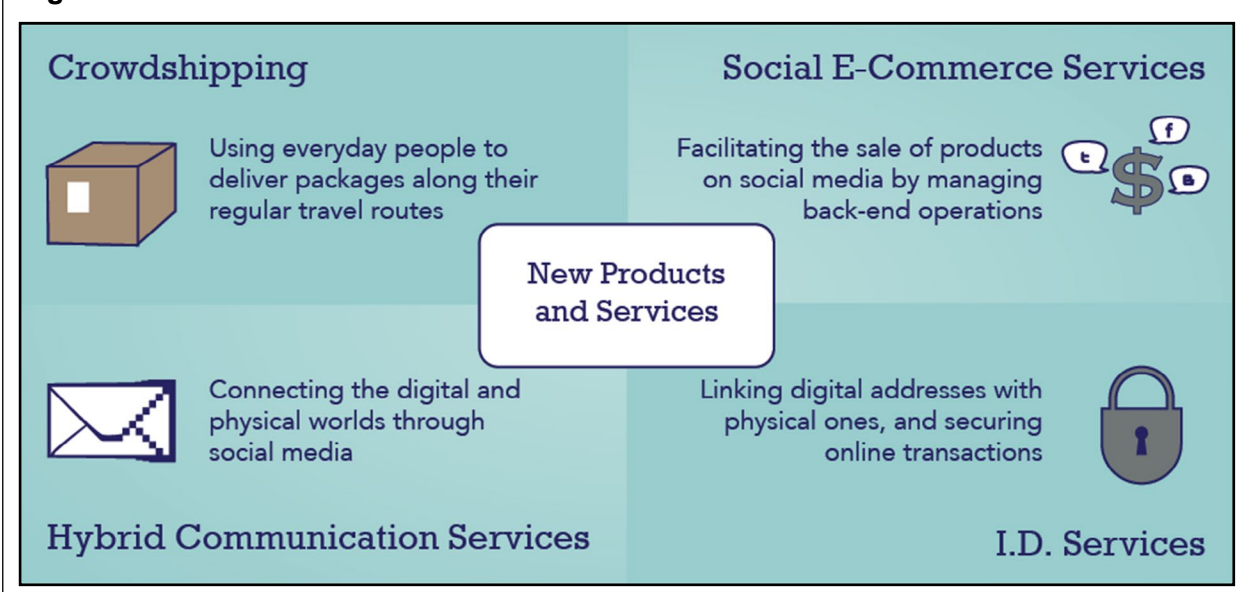
Figure 2: Potential Social Postal Products and Services

The Postal Service could also use social media to create entirely new product lines. Some of the ideas presented below are more immediate, but others are more speculative or might require legislative action.<sup>43</sup> As mentioned previously, social media changes rapidly and no one knows what the future will hold. It is important for the Postal Service to keep an open mind and constantly look for new opportunities, as presented in Figure 2: Services to provide, gaps to fill, and new revenue possibilities.