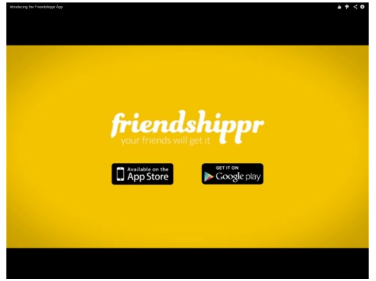
| Video 3: Friendshippr, a Crowdshipping Startup