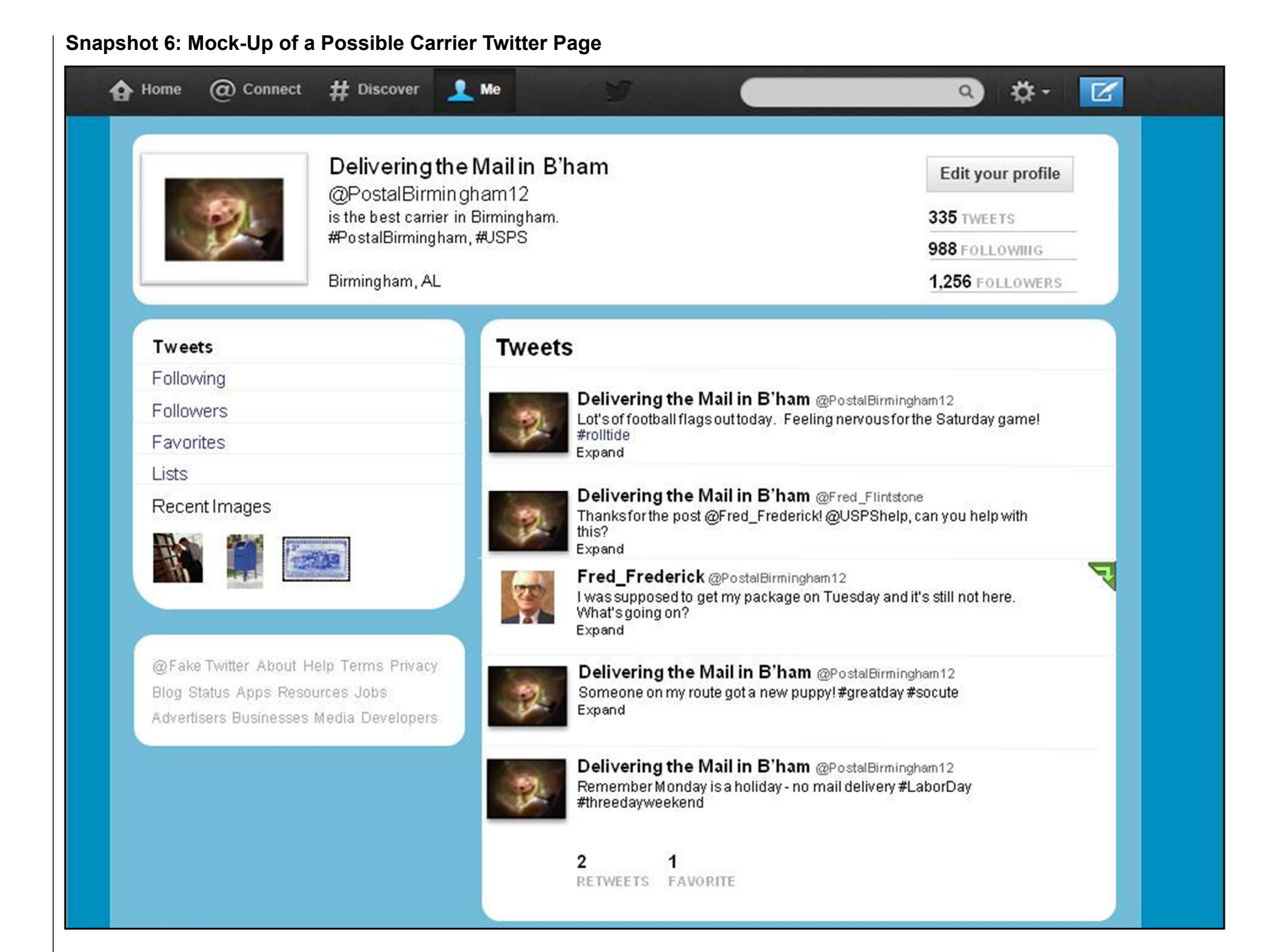
Step 3: Leverage the Network

This means using social media channels to promote a positive brand image, market current products and services, and create new products and services. The value and benefits that social media can bring to a business increase as the size of the network increases. The Postal Service has launched several network-leveraging initiatives, but the return is limited because of the relatively small size of the agency's social media audience. Only when the Postal Service develops a strong and wide network of followers will it be better able to fully harness the power of social media. Here are some ideas for leveraging its network that the Postal Service could consider when the time becomes appropriate.