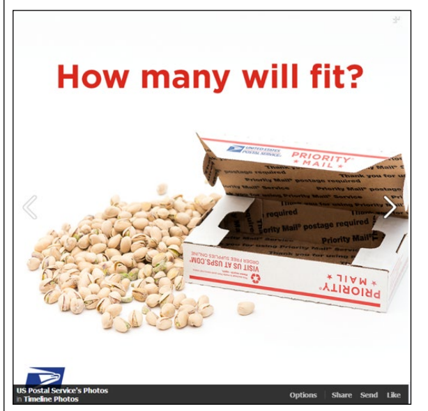
Snapshot 2: Popular Recent Postal Service Post on Facebook

are quickly becoming a powerful consumer force, and the Postal Service is going to have to become more relevant to this population if it wants to be viable in the future. Just establishing a presence on social media gives the Postal Service the ability to reach these customers on their preferred channel, but building a relationship requires more effort to create (1) content relevant to their interests and (2) an informal tone that echoes the communication style of younger generations.