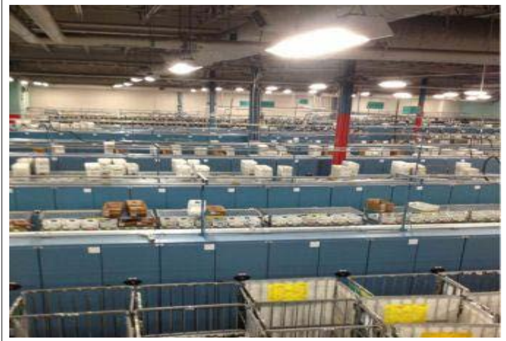
Figure 2. DBCS Machines at the Huntsville P&DF