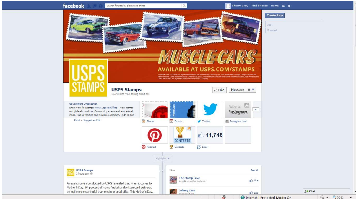
Figure 3. The Postal Service's Stamps Facebook Page