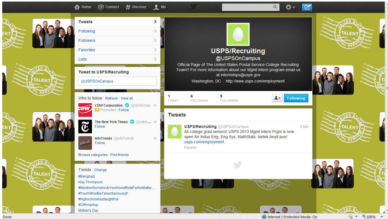
Figure 1. The Postal Service's Recruiting Twitter Page