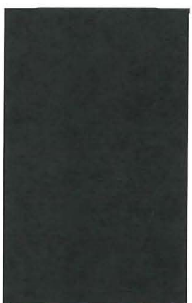
Figure 4: Sample Visitor ID Badge

Upon gaining access to NFSTC, visitors are required to check-in by presenting proper identification (with a picture). Once the ID has been verified, visitors are provided with an NFSTC visitor ID badge which must be worn and displayed at all times while they are on the premises. Reference figure 4 below: