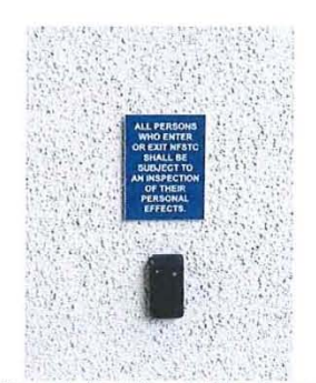
Figure 3: Back Door Building Access

Upon gaining access to NFSTC, visitors are required to check-in by presenting proper identification (with a picture). Once the ID has been verified, visitors are provided with an NFSTC visitor ID badge which must be worn and displayed at all times while they are on the premises. Reference figure 4 below: