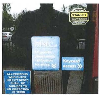
Figure 2: Front Entry Building Access

, that helps prevent unauthorized access to NFSTC's facility. Signs documenting visitor access requirements are posted at the front and back entrances of the building. Reference Figures 2 and 3 below: