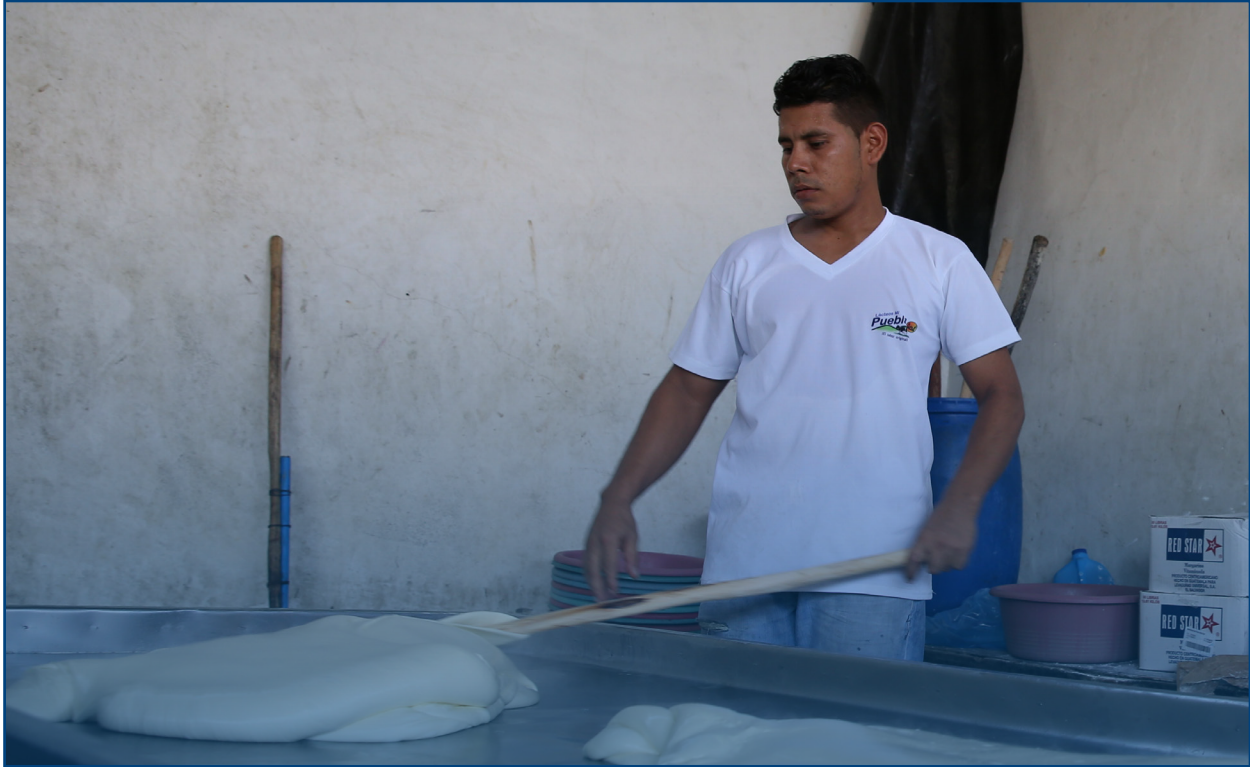
A dairy worker stretches out hot puebla cheese in El Salvador's Northern Zone, where MCC has supported vocational education in areas sought by employers. Photo: MCC/Eric Firnhaber (September 16, 2015)