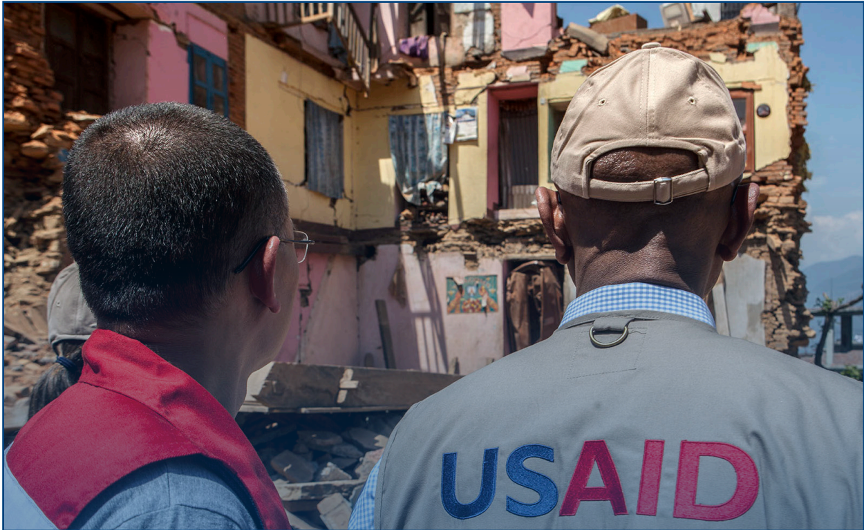
USAID's acting Administrator Alfonso E. Lenhardt (right) visits Sindhupalchowk District in central Nepal, 10 days after the devastating 7.8 magnitude earthquake on April 25, 2015. (May 5, 2015)