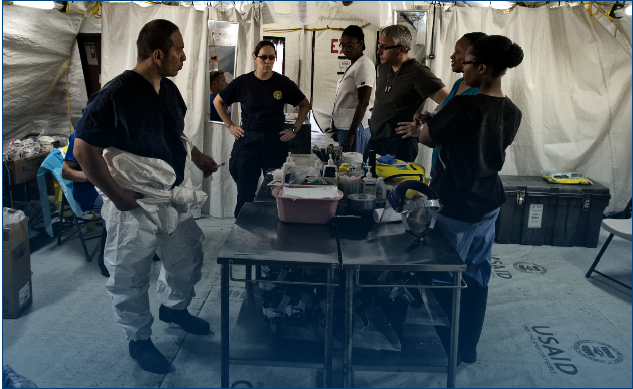
Medical workers in Liberia gather in a treatment unit provided by USAID as part of the interagency U.S. Government Ebola response. Photo: USAID/Neil Brandvold (January 31, 2015)