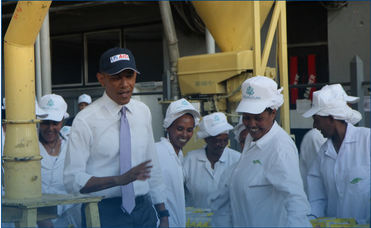
In Addis Ababa, President Obama tours Faffa Food Factory, which received USAID and Feed the Future funding to provide low-cost nutritionally fortified foods to Ethiopians. (July 27, 2015)