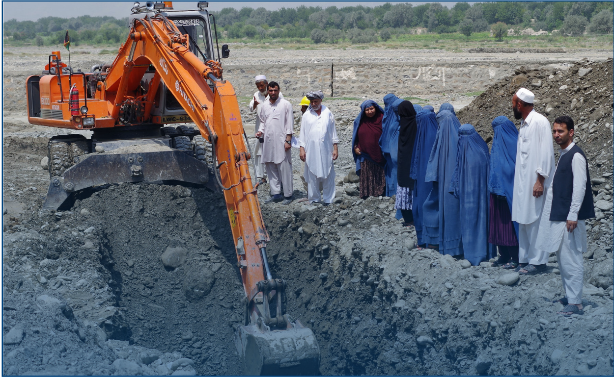
Mando Zayi District Development Assembly leaders from Logar Province, Afghanistan, conduct a monitoring visit of a USAID-funded project to build a wall to shield farmland from flash floods. (November 12, 2013)