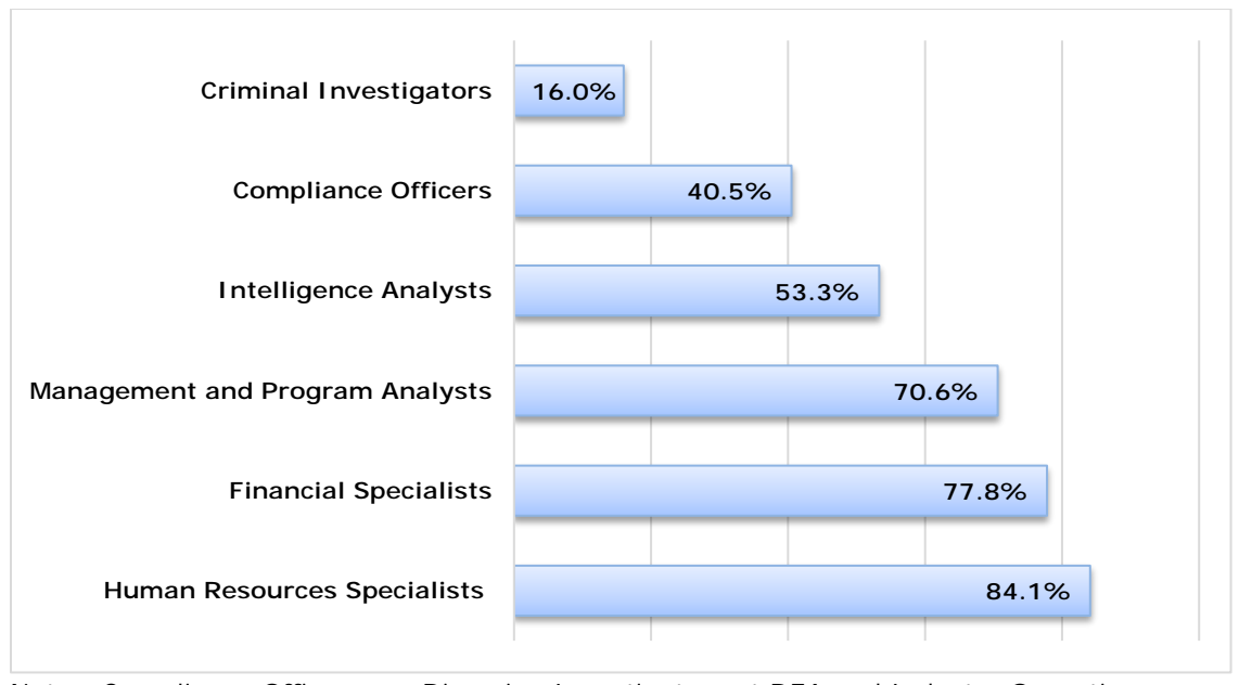
Figure 1 Percentage of Women in Selected Occupations at ATF, DEA, FBI, and USMS, FY 2016

Note: Compliance Officers are Diversion Investigators at DEA and Industry Operations Investigators at ATF.