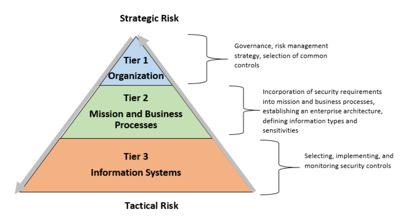
Figure 2: The Three Tiers of Risk Management