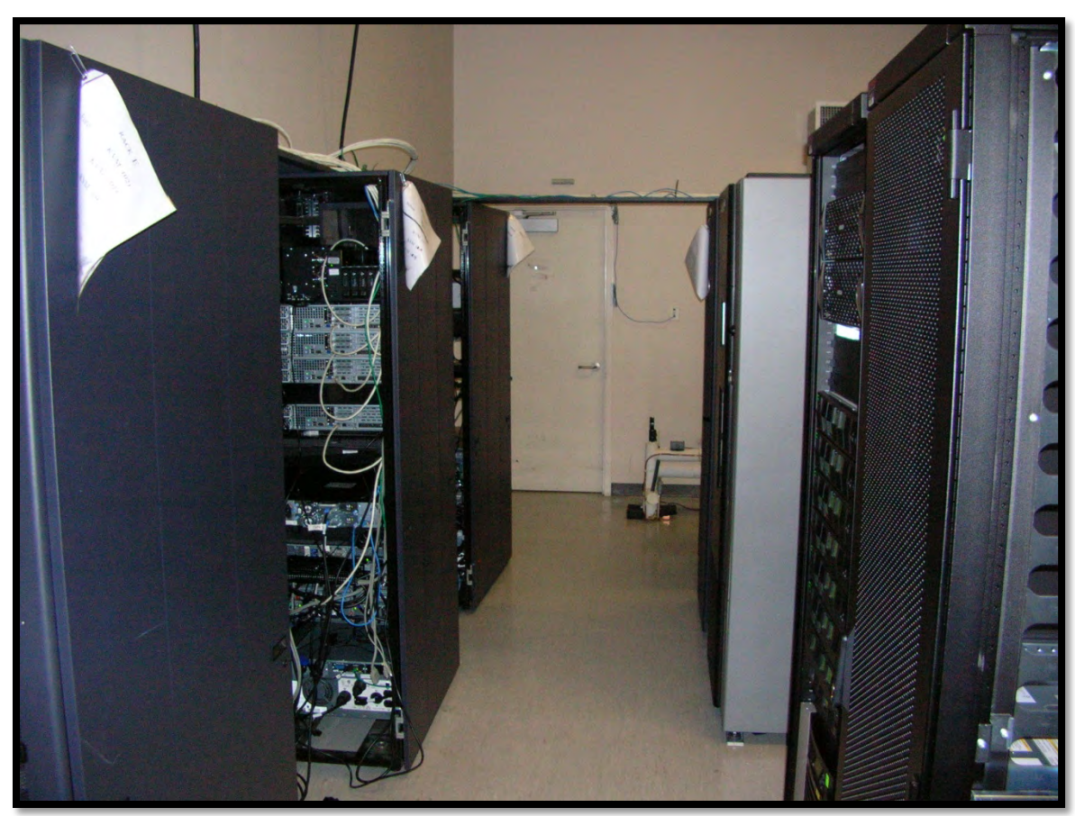
*Pictured above are storage servers for the Digitization Labs, taken 20 November 2014 at Archives II. The servers on the left are the old servers being replaced, while the servers on the right are new purchases.

In June 2014, the Digitization Labs received $500,000 in funding from the Architecture Review Board for improvements to infrastructure. With this funding, the Digitization Labs were able to purchase a new tape library system. The tape library system purchased by NARA has two petabytes of storage currently, and is scalable up to over 25 petabytes at maximum capacity given continued investment. The system was installed at the end of calendar year 2014. The NARA staff member in charge of Digitization Lab infrastructure plans to move all digitized files from the existing servers in the Digitization Labs to the new tape library system (see photo below). The storage space purchased is expected to provide the Digitization Labs with enough capacity to produce at historical output rates for the next few years. However, with sufficient storage in place, it is possible the Digitization Labs will produce at a rate greater than historical output. As a result, the Digitization Labs may fill the new two petabyte storage space faster than anticipated, putting NARA back in a situation in which storage limitations negatively impact digitization efforts.