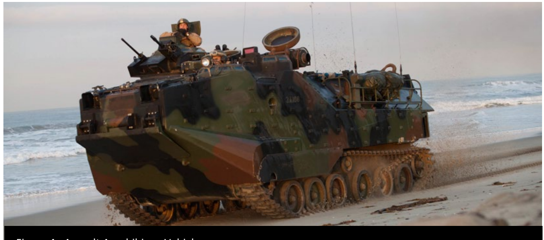
Figure 4. Assault Amphibious Vehicle

The Marine Corps has 15 types of GCTV.<sup>6</sup> We reviewed the DMFA for all variants of the Assault Amphibious Vehicle (AAV), Light Armored Vehicle (LAV), and Mine Resistant Ambush Protected (MRAP) vehicle.<sup>7</sup> The AAV is a combat vehicle that can immediately transition from water to land operations. The AAV has been in the Marine Corps inventory since 1972 and has undergone multiple modernization efforts, including the Reliability, Availability, Maintainability/ Rebuild to Standard (RAM/RS) variant, which improved vehicle performance. The Marine Corps planned to extend the service life of the AAV with the Survivability Upgrade modernization program, but the plan was canceled on August 30, 2018. Due to the AAV Survivability Upgrade cancellation, we will only discuss DMFA for the AAV RAM/RS. See Figure 4 for a picture of an AAV.