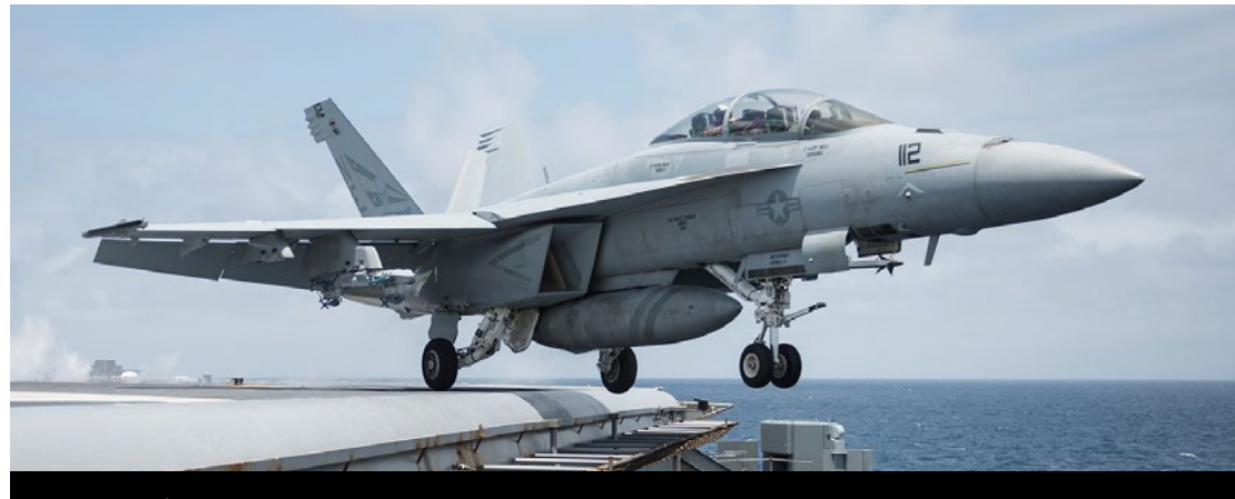
Figure 1. F/A-18F Super Hornet, Two-Seat Model

The Navy and Marine Corps have 102 different models of aircraft.<sup>5</sup> During this audit, we reviewed the BAA for all models of the F/A-18, MH-60, and T-45 aircraft. The F/A-18 Hornet (F/A-18 A-D models) and Super Hornet (F/A-18 E-F models) are multi-mission naval strike fighters used by the Navy and Marine Corps. The F/A-18 was initially deployed in 1978 and received a major upgrade in the late 1990s. According to program office officials, the F/A-18 A-D is expected to remain in service until 2030 and the F/A-18 E-F replacement is planned to start in the 2030s. See Figure 1 for a picture of an F/A-18F Super Hornet.