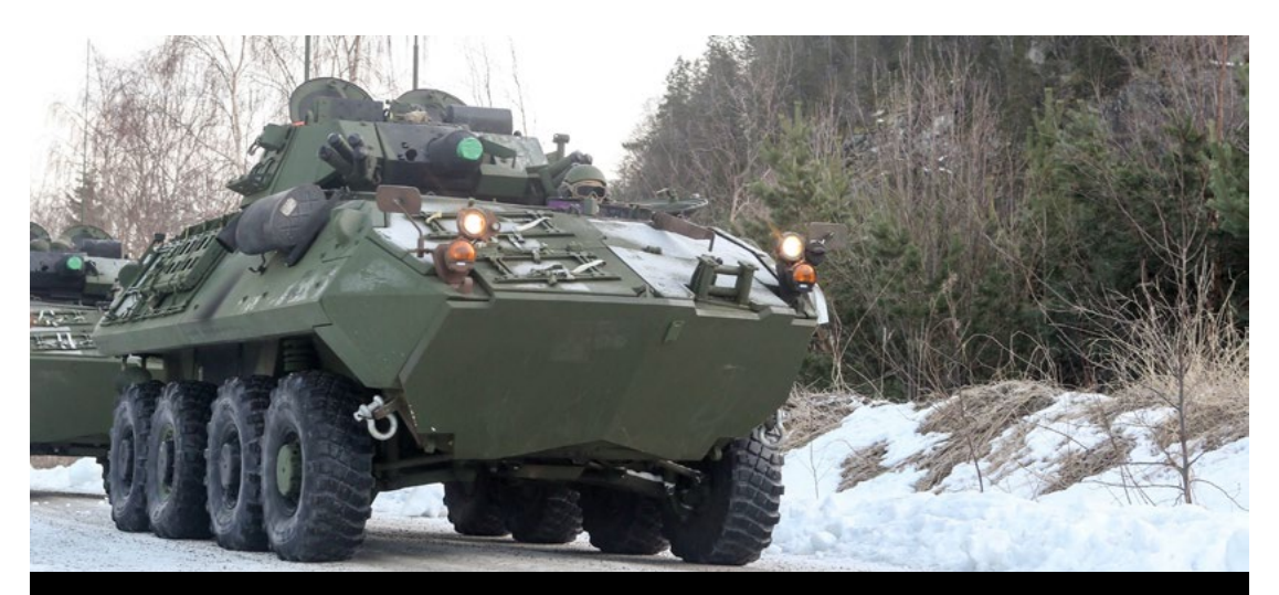
Figure 5. Light Armored Vehicle

The MRAP is a tactical vehicle with a blast resistant underbody and other features designed to withstand improvised explosive devices, mines, and direct-fire weapons. The MRAP has been in the Marine Corps inventory since 2007, is currently undergoing maintenance, and upgrades. The Marine Corps plans to retire most MRAPs from service by 2024. See Figure 6 for a picture of an MRAP vehicle.