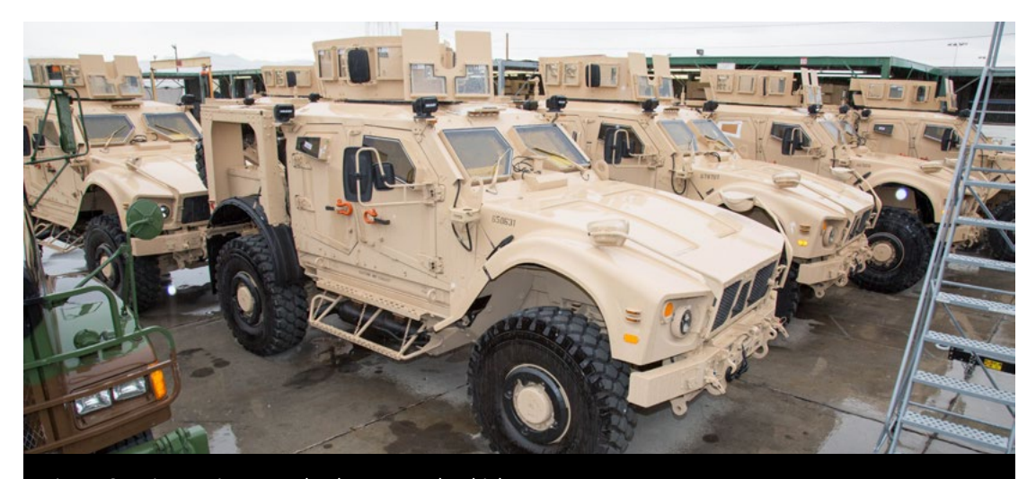
Figure 6. Mine Resistant Ambush Protected Vehicle

The MRAP is a tactical vehicle with a blast resistant underbody and other features designed to withstand improvised explosive devices, mines, and direct-fire weapons. The MRAP has been in the Marine Corps inventory since 2007, is currently undergoing maintenance, and upgrades. The Marine Corps plans to retire most MRAPs from service by 2024. See Figure 6 for a picture of an MRAP vehicle.