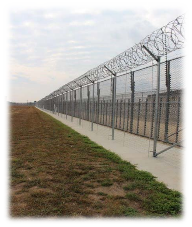
Figure 1 Electronic Taut Wire Fence Detection System at AUSP Thomson