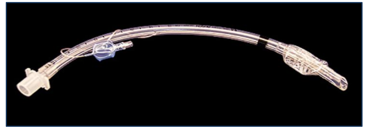
Figure 3. Endotracheal tube<sup>92</sup>