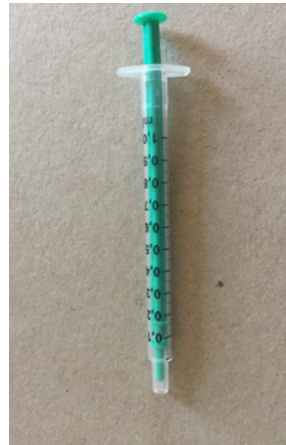
Figure 5. The zero-space syringe used at the facility

The nurse draws the prescribed patient dose from the medication cup into a zero-space safety syringe and administers it to the patient orally by dispensing it into the patient's vestibule (the area between the inside of the cheek and the teeth and gums).