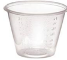
Figure 4. Sample of a medication cup.

The nurse dispenses the prescribed patient dose into a medication cup and either administers the medication to the patient orally using the cup or proceeds to Step 4.