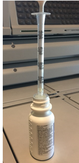
Figure 2. Bottle of oxycodone solution with manufacturer-calibrated syringe and adapter cap

The nurse removes the bulk bottle of oxycodone solution, which is fitted with an adapter cap, from the Omnicell®.