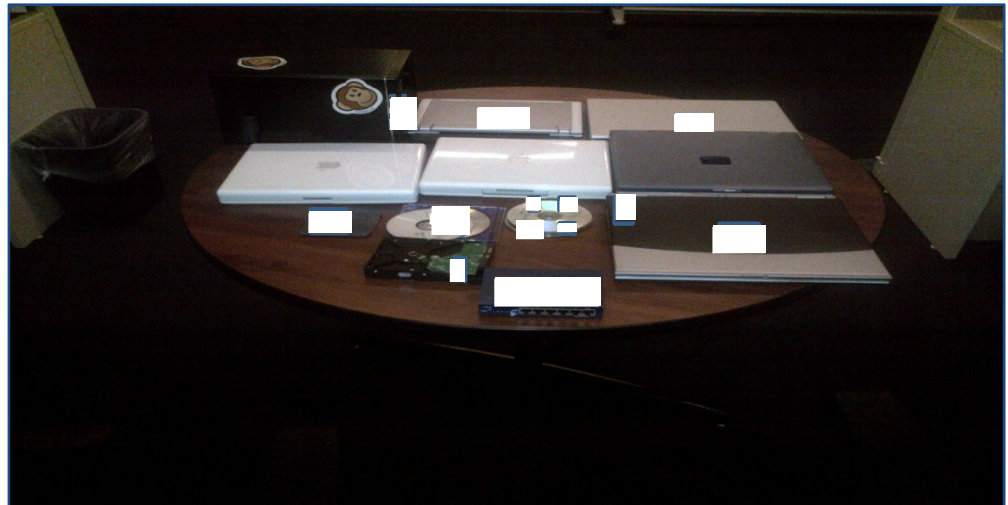
Figure. Unsecured Portable Data Storage Devices

Source: VA OIG; Leased Space, Boston, MA; 3:19 p.m.; December 16, 2013