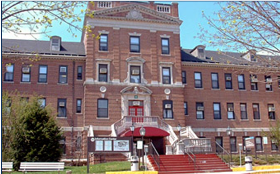
Figure 2. Edith Nourse Rogers Memorial Veterans’ Hospital, Bedford, Massachusetts.

An OIT representative indicated the VA Bedford Healthcare System consists of the Edith Nourse Rogers Memorial Veterans’ Hospital, shown in figure 2, and the Gloucester, Haverhill, and Lynn VA clinics. The Edith Nourse Rogers Memorial Veterans’ Hospital managed 16,947 unique outpatients in FY 2023. It houses 356 beds, including 238 community living beds and a 51-bed domiciliary for veterans who are experiencing homelessness or at risk of homelessness. The facility has 1,514 full-time employees and a budget of $225 million for FY 2023.