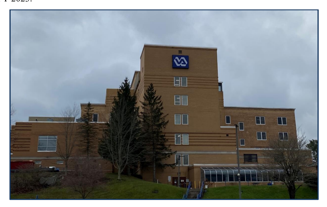
Figure 2. Beckley VA Medical Center.

The VA Beckley Healthcare System consists of the Beckley VA Medical Center and the Princeton and Greenbrier community-based outpatient clinics. The Beckley VA Medical Center saw 12,799 unique outpatients in FY 2022. It also houses 30 general medical care beds and 50 community living center beds.<sup>24</sup> The facility has 963 employees and a budget of $104 million for FY 2023.