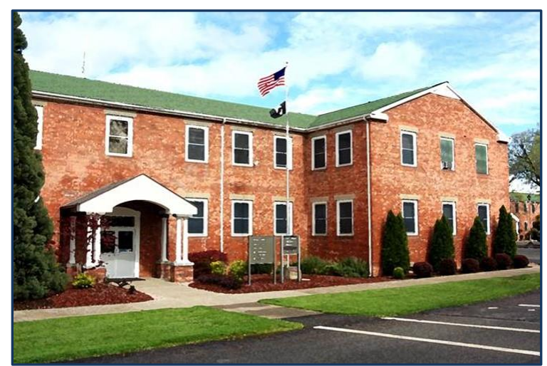
Figure 2. Southern Oregon Rehabilitation Center and Clinics.

The SORCC is part of the VA Southern Oregon Healthcare System. The facility saw 16,290 unique outpatients in FY 2021. It also operates a 181-bed capacity mental health residential rehabilitation treatment program. The facility has about 800 full-time employees and a budget of $249 million for FY 2022.<sup>28</sup>