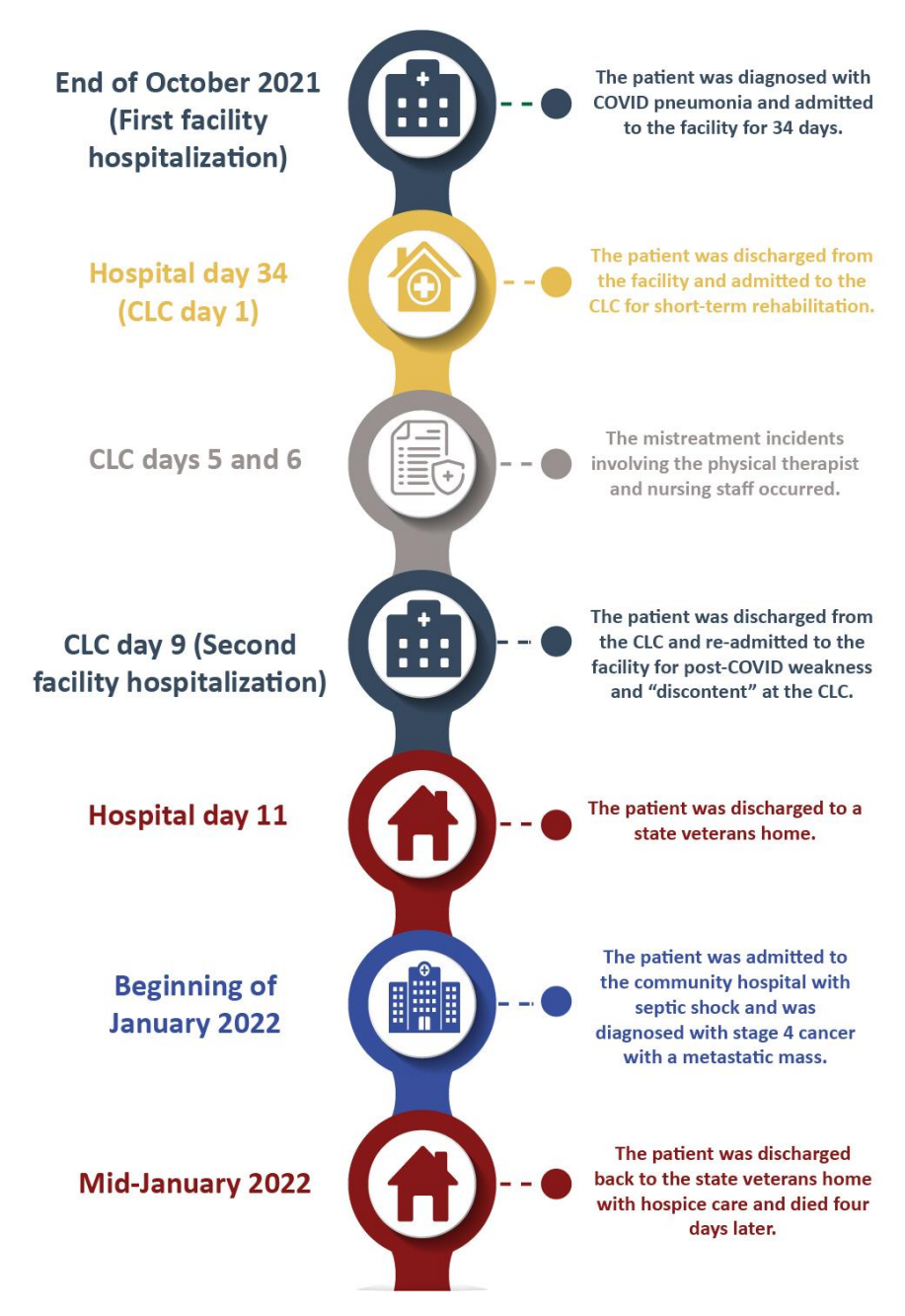
Figure 1. Timeline of the Patient's Care. Source: The OIG's review of the patient's electronic health record.

The OIG substantiated the allegation that the patient was forced to participate in physical therapy in the CLC by a physical therapist and nursing staff. Specifically, on two occasions, the physical therapist obtained assistance from nursing staff to force the patient to participate in physical therapy sessions after the patient refused. According to the VHA Handbook, patients "have the