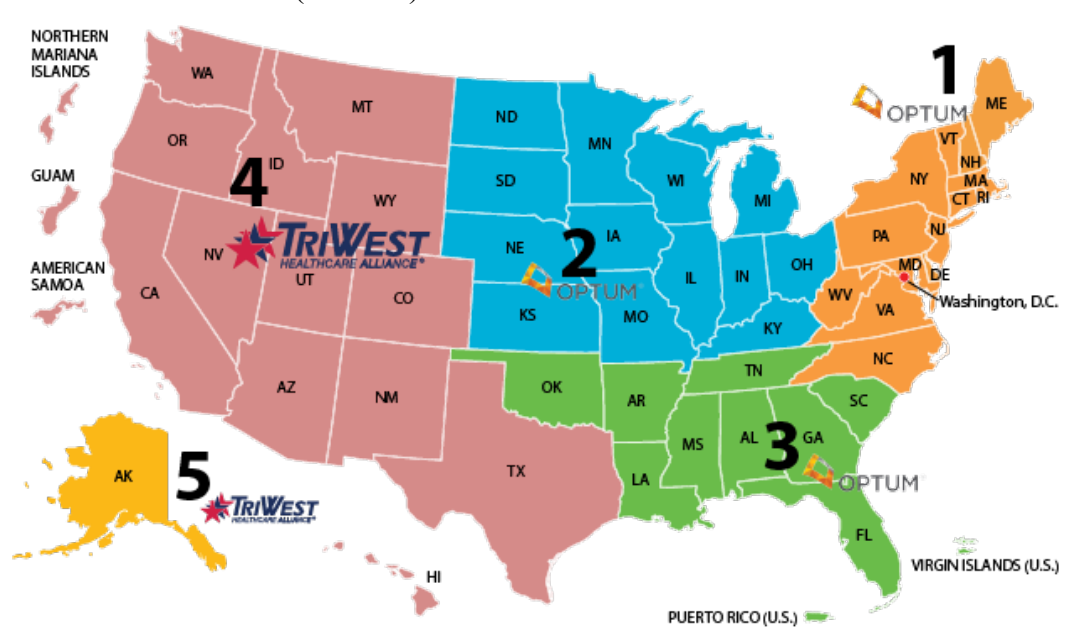
Figure 1. Five regional networks that comprise VA's CCN.

The CCN consists of five regional networks covering all US states and territories (figure 1). VA contracts with two third-party administrators to manage these five regions. Regions 1–3 are administered by Optum Public Sector Solutions (Optum), and regions 4–5 are administered by TriWest Healthcare Alliance (TriWest).