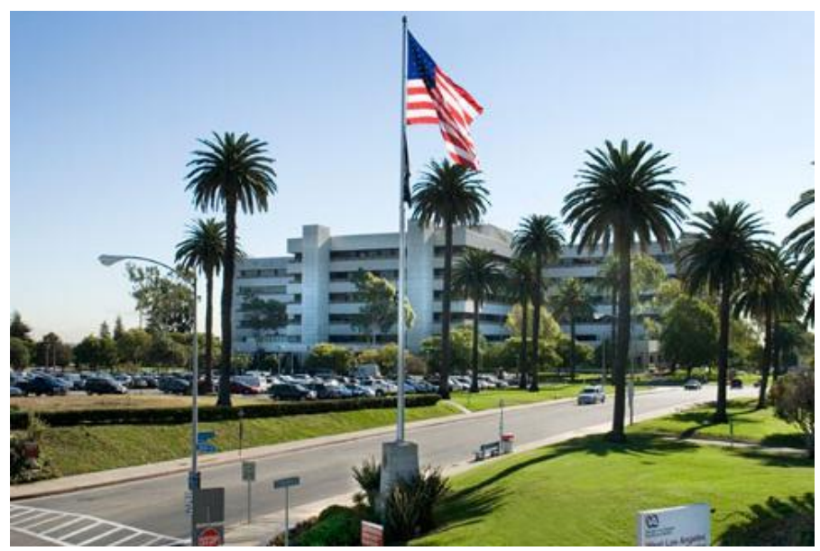
Figure 1. West Los Angeles VA Medical Center of the VA Greater Los Angeles Healthcare System in California.