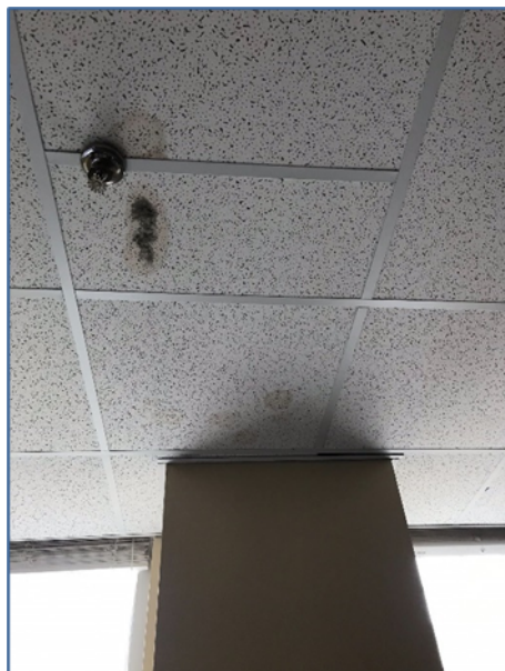
Figure 2. Discolored ceiling tile in building 2, room 113E (office in outpatient mental health).