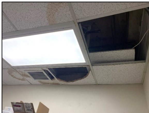
Figure 1. Broken and displaced ceiling tiles in building 1, room 12.

above the ceiling.” 33 The OIG team identified two patient care areas with missing ceiling tiles. The missing tiles were reported to engineering staff through the work order process and staff reported the tiles had been replaced. Figure 1 is a picture of broken and displaced ceiling tiles in building 1, room 12 (office in audiology). 34