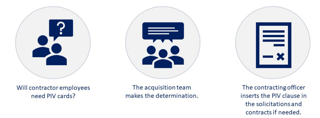
Figure 3. Overview of PIV card determination.

Figure 3 shows an overview of the steps during contract planning.