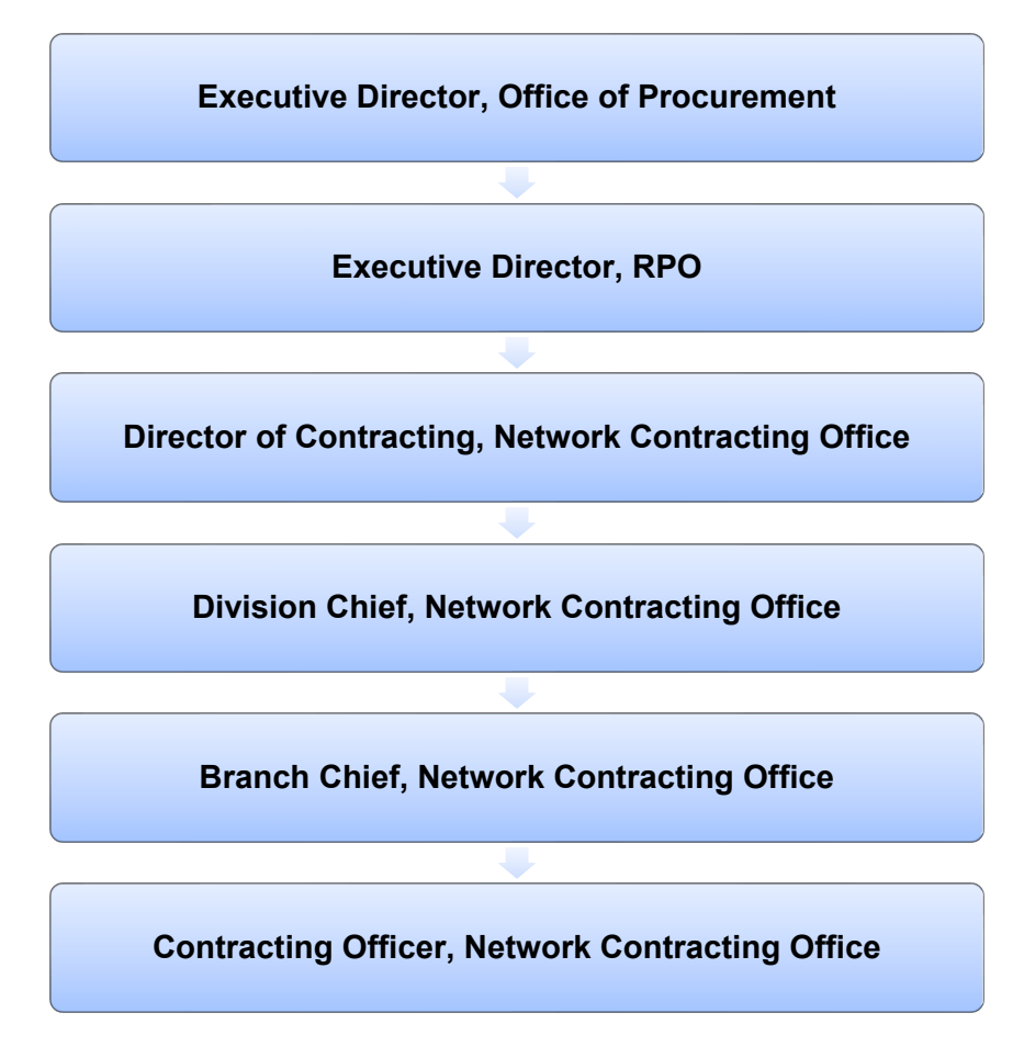
Figure 1. Office of Procurement hierarchy.