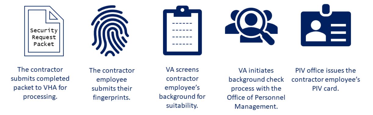
Figure 4. Overview of PIV card eligibility determination and issuance.

Figure 4 provides an overview of the steps involved after the contract is awarded.