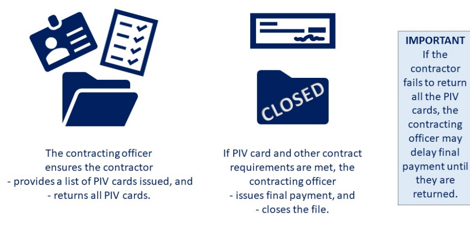
Figure 6. Overview of PIV card return verification.

Figure 6 provides an overview of the requirements for PIV card return verification.