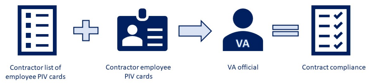
Figure 5. Overview of PIV card monitoring and return.

Figure 5 provides an overview of PIV card monitoring and return.