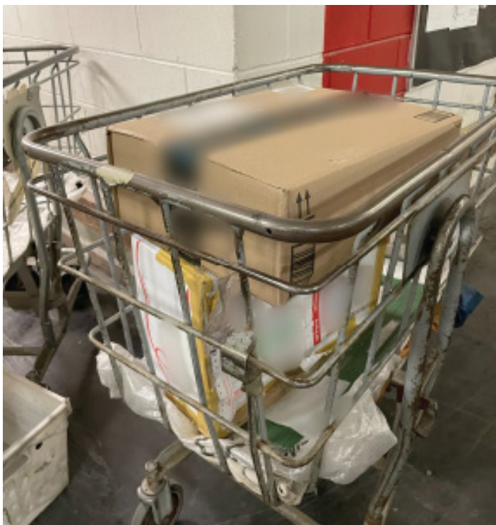
Figure 2. Example of Delayed Mail at the Carrier Cases