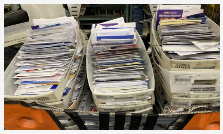
Delayed Mail at Customer Service Area