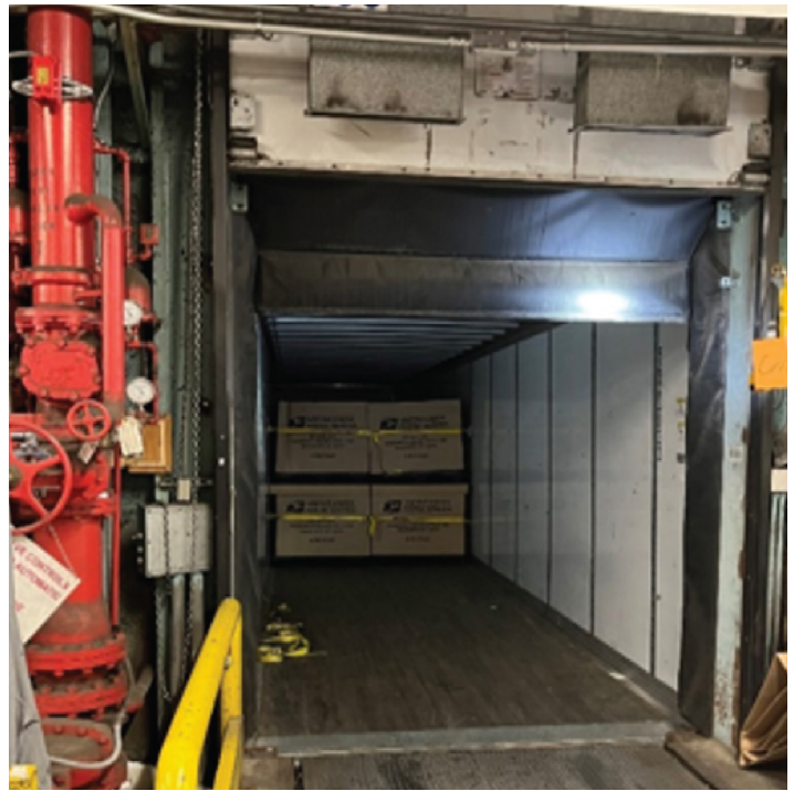
Figure 1. Inaccurate Trailer Utilization Calculation