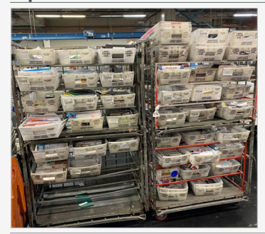
Figure 2. Delayed Mail in the Manual Letter Operation

We identified mail in the manual letter and flat operations on June 13 and 14, 2023 (see Figures 2 and 3) that management stated included delayed mail. However, the containers were not labeled with dates so the amount of delayed mail could not be determined. Further, management did not report any manual delayed mail in Mail Condition Visualization (MCV)<sup>8</sup> on either day.