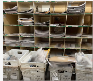
Source: OIG photos taken June 13 and 14, 2023, in the manual flat operation.

In addition, we observed multiple instances of mailpieces (letters, flats, and parcels) throughout the workroom floor and around various machines that were not being cleared once sorting was completed and moved to its proper area (see Figure 4).