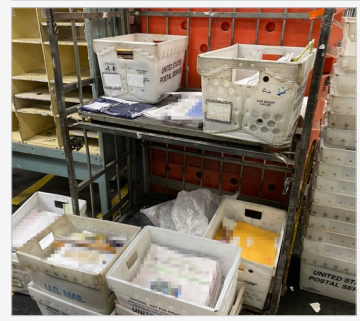
Figure 3. Delayed Mail in the Manual Flat Operation