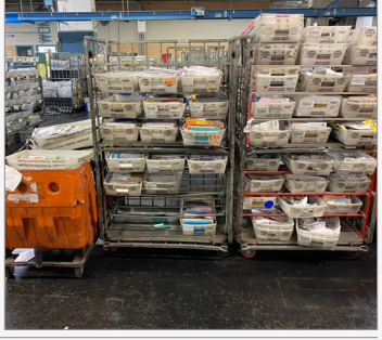
photos taken June 13 and June 14, 2023, in the manual letter operation.