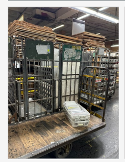
Figure 4. Examples of Mail Found Throughout the Workroom Floor

In addition, we observed multiple instances of mailpieces (letters, flats, and parcels) throughout the workroom floor and around various machines that were not being cleared once sorting was completed and moved to its proper area (see Figure 4).