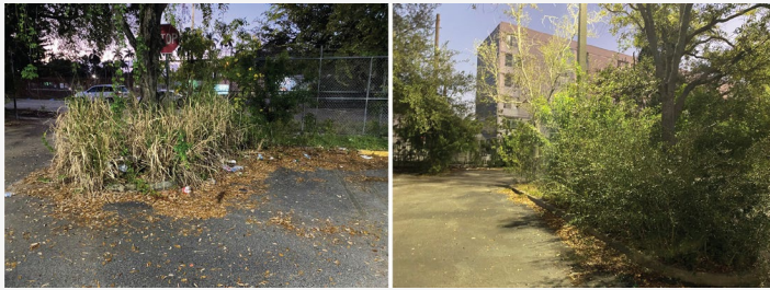
Figure 2. Overgrown Landscaping in Employee Parking Lot