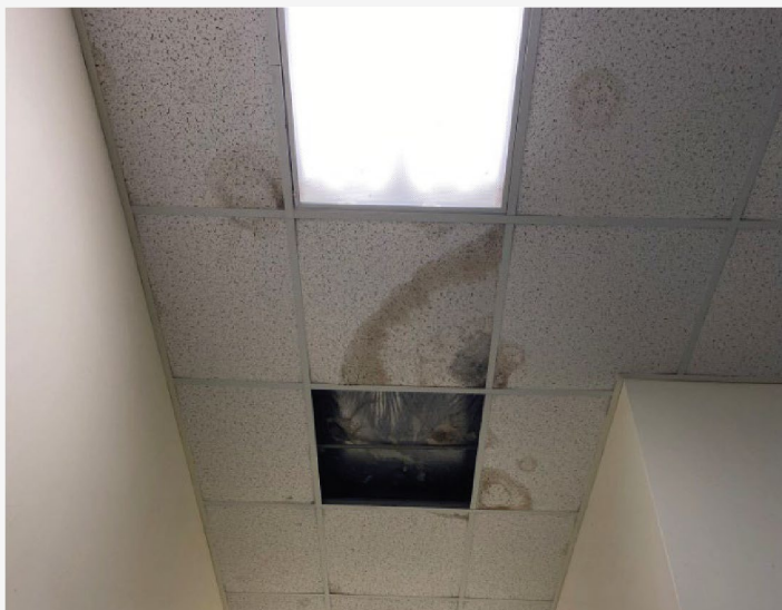
Figure 3. Stained and Missing Ceiling Tiles