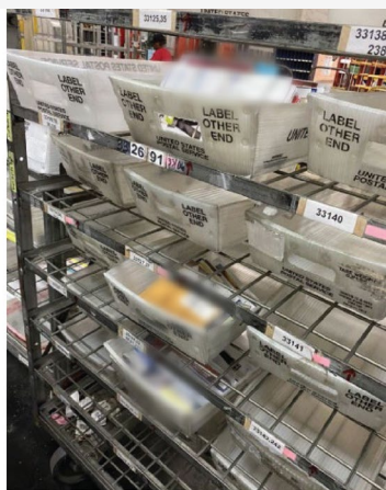
OIG photos taken February 1, 2023 at 6:30 a.m.