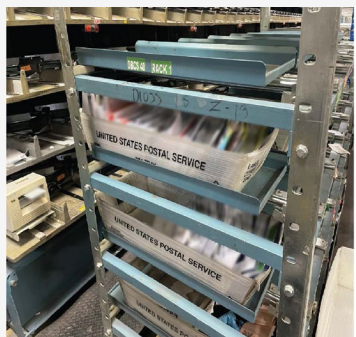
Figure 1. Mail Remaining at a Delivery Barcode Sorter Machine

We found delayed mail on processing machines and in the manual unit each day of our observations. For example, on Wednesday, February 1, 2023, we identified about 3,4408 delayed mailpieces on a machine belt and in the sort bins and sort trays of several machines after mail sortation was completed. This mail should have been moved to the next operation for final processing and dispatch. As a result, the mail was not dispatched until the following day (see Figure 1).