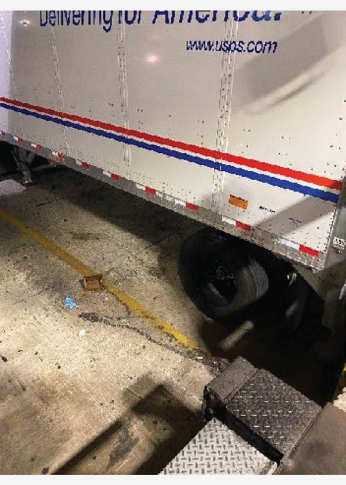
Source: OIG photos taken January 30, 2023 at 3:22 a.m. and on February 1, 2023 at 4:24 a.m., respectively.