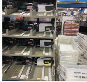
OIG photos taken February 1 at 5:45am and February 2, 2023, at 6:00 a.m., respectively.

On Wednesday, February 1, 2023, the team also identified multiple trays of delayed mail in the manual mail unit after 6:30 a.m. At the Miami P&DC, the critical time for dispatch of mail to delivery units is 5:45 a.m. Management reported 22,422 delayed mailpieces in the manual unit that day. As a result, mail in the manual unit destined for local delivery was not dispatched to the delivery units until the following day (see Figure 2).