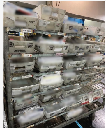
Figure 2. Delayed Mail in Manual Unit

In addition, we found late arriving collection mail<sup>9</sup> each day of our observations. For example, on Monday, January 30 at 3:15 p.m., we identified unprocessed collection mail next to the Advanced Facer Canceler System<sup>10</sup> machine that arrived in the facility at 12:44 a.m. on January 28, 2023 (see Figure 3). This mail should have been processed and dispatched for delivery on the morning of January 30, 2023.