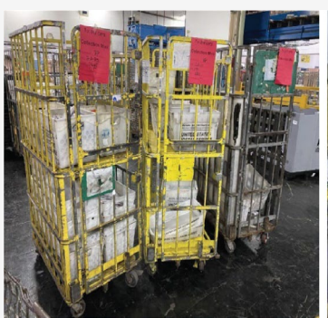
Figure 4. Late Arriving Collection Mail from Royal Palm P&DC

Additionally, the Miami P&DC received late arriving collection mail (after the critical entry time for processing) from delivery units and the Royal Palm P&DC. According to facility management, the Royal Palm P&DC often receives collection mail improperly sent from delivery units. Management also stated that this collection mail is often identified and transferred to their facility too late for timely processing. For example, on February 2, 2023, the Miami P&DC received collection mail from the Royal Palm P&DC at 2:45 a.m. (see Figure 4). However, management did not communicate this ongoing issue to the delivery units through the Mail Arrival Quality/Plant Arrival Quality (MAP/PAQ) system.<sup>12</sup>