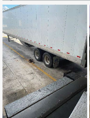
Figure 6. Trailers Without Wheel Chocks

We also observed unsecured trailers leaving the Miami P&DC that contained mail. Specifically, PVS drivers were not always securing trailer doors with a padlock or using the internal trailer door lock when departing from the facility to delivery units.