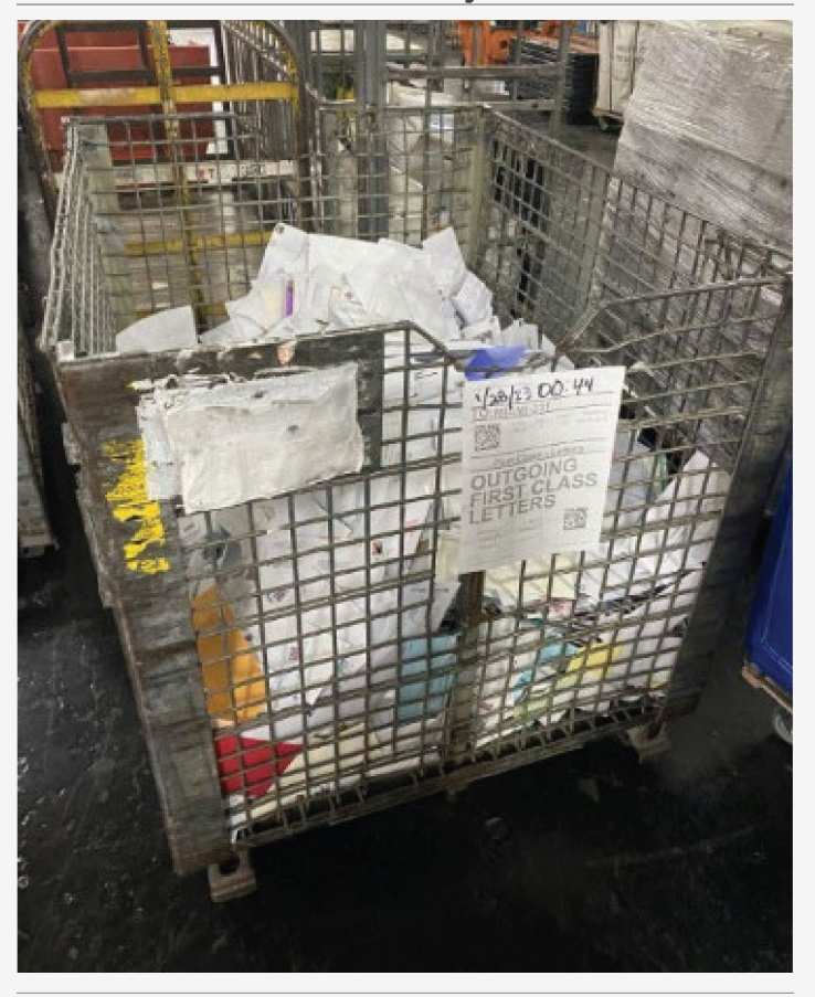
OIG photos taken January 30, 2023 at 3:15pm.