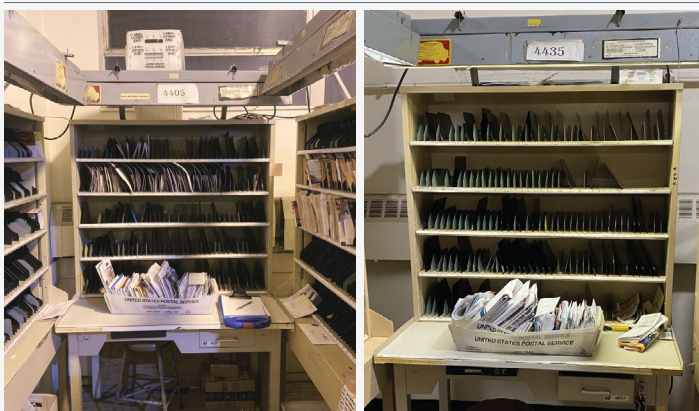
Figure 1. Examples of Delayed Mail in Carrier Cases