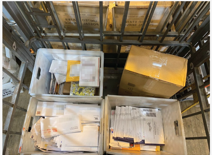
Figure 2. Delayed Collection Mail