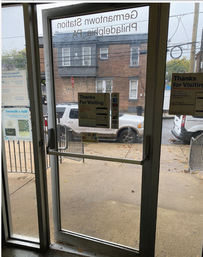
Figure 3. Entrance Door Does Not Close Properly