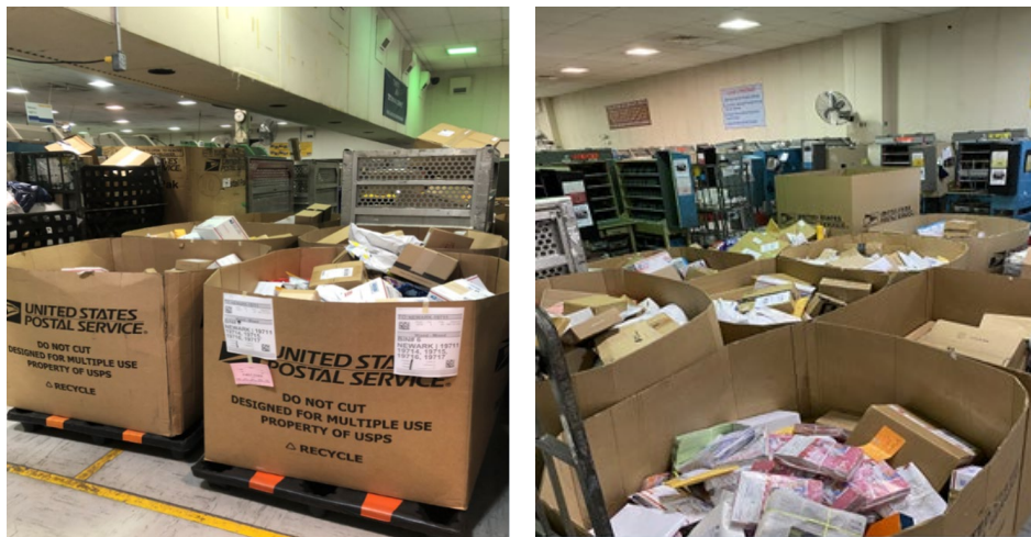
Figure 1. Delayed Priority and First-Class Parcels