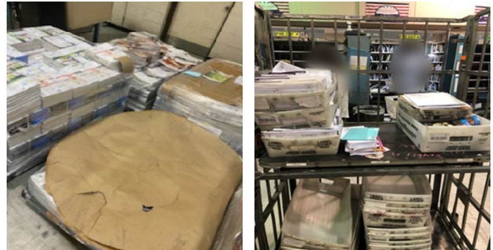
Figure 2. Delayed Flats and First-Class Letters