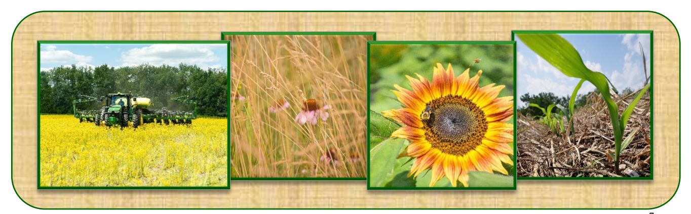
Figure 2: Through CSP, NRCS Seeks to Improve Soil, Water, and Other Natural Resources.<sup>7</sup>