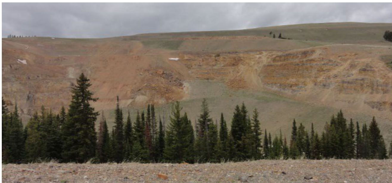
Figure 1: Mine cleanup project in a national forest. It does not depict any particular audit or investigation.

The Infrastructure Investment and Jobs Act (IIJA) was signed into law on November 15, 2021. This legislation provided funding to “rebuild America’s roads, bridges and rails, expand access to clean drinking water, ensure every American has access to high-speed internet, tackle the climate crisis, advance environmental justice, and invest in communities that have too often been left behind.” It provided the Forest Service (FS) approximately $5.5 billion for reducing the risk of wildland fire, restoring ecosystems, and investing in natural resources related to infrastructure. Of this funding, $100 million was made available specifically “to restore native vegetation and mitigate environmental hazards on mined land on Federal and non-Federal land.” 1, 2