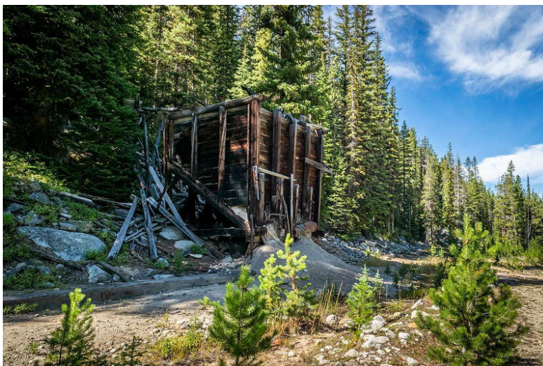
Figure 5: Abandoned mining structure in a national forest. USDA photo by Preston Keres. It does not depict any particular audit or investigation.

To accomplish this, FS is planning to allocate funds among three regions for use on projects that are expected to restore native vegetation on FS lands that were mined and to consider environmental justice, equity, and climate resilience. FS proposed in the IJA BP to allocate 33.16% of the funds to FS' Southern Region, 47.46% of the funds to FS' Eastern Region, and 19.38% of the funds to FS' Alaska Region.