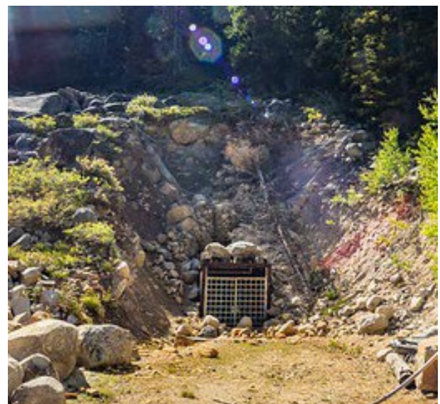
Figure 4: Entrance to an abandoned mine in a national forest. It does not depict any particular audit or investigation.

According to FS, this ecosystem restoration work is slated to be completed through existing contracts or agreements with parties that have the technical expertise and specialized training to conduct environmental cleanups. FS also noted in the IJJA BP that 7 of these 10 projects appear to be in or near disadvantaged communities that are marginalized, underserved, and overburdened by pollution.