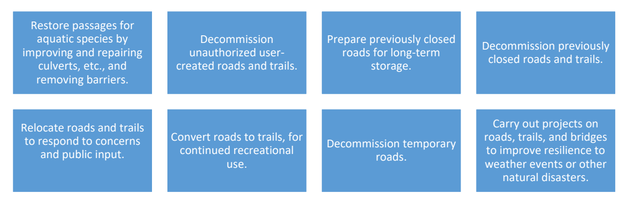
Figure 1: Eight Activities That Qualify for IIJA Legacy Road and Trail Remediation Program Funding

The National Forest System is made up of more than 150 National Forests and Grasslands. Within these forests and grasslands, Forest Service manages hundreds of thousands of miles of roads and trails, as well as thousands of bridges, some of which are used for recreational access and resource management. Forest Service can use IIJA Legacy Road and Trail Remediation Program funding for the following types of project activities: