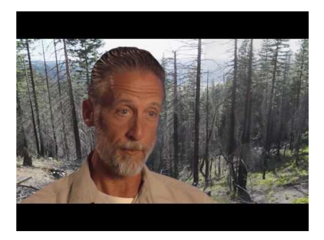
Figure 4: Culvert and Road Restoration- Forest Service YouTube. Last accessed June 29, 2023.

The IIJA Legacy Road and Trail Remediation Program funds projects such as improvements to roads and aquatic organism passages.