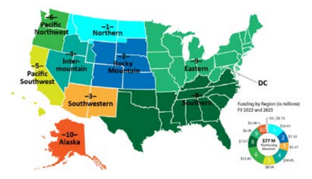
Figure 3: IIJA Legacy Road and Trail Remediation Program Funding by Forest Service Region<sup>3</sup> Scroll over each region for additional details on the number of projects funded. Disclaimer: For full interactivity, we recommend viewing this product with desktop software.

As of April 10, 2023, Forest Service has funded IIJA Legacy Road and Trail Remediation Program projects in each region,<sup>2</sup> as follows: