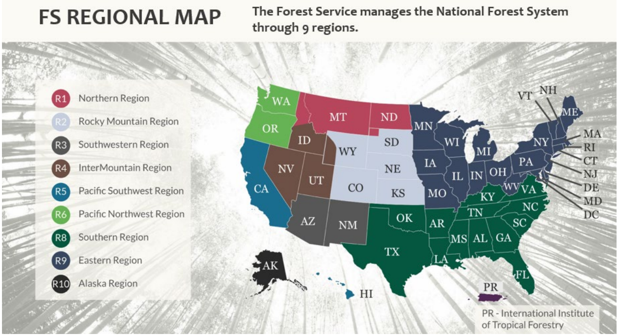
Figure 1: Map of FS' Nine Regions.

The FS headquarters is located in Washington, DC. As part of its organizational structure, FS also includes the National Forest System (NFS), which is managed through nine regions (see Figure 1).