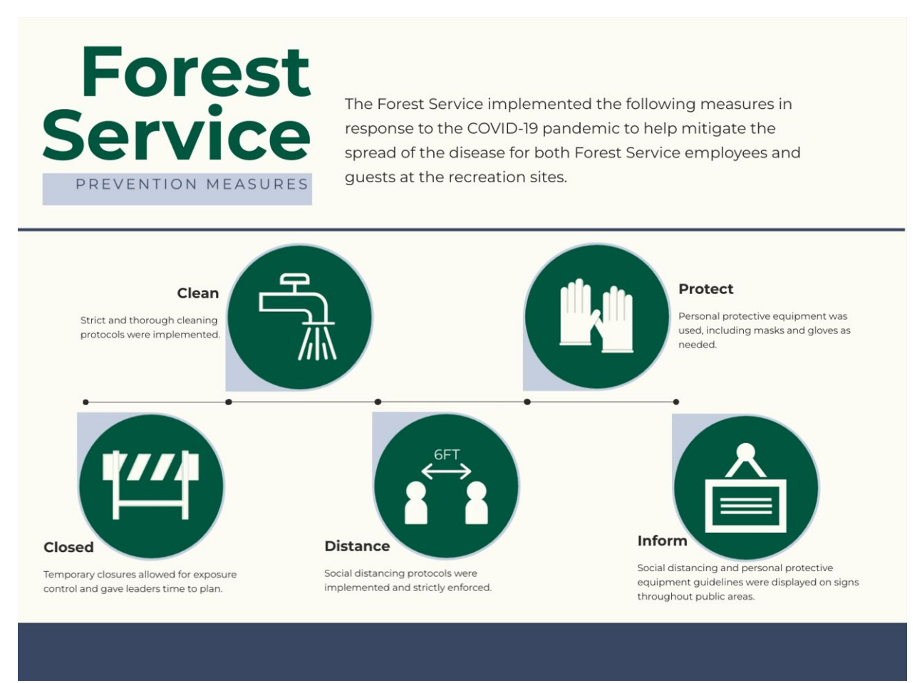
Figure 2: FS' Prevention Measures.

We found that FS identified a framework of measures to manage its response to COVID-19 at recreation sites. The measures were designed to mitigate agency employees' and the public's exposure to COVID-19. Such measures included the temporary closure of recreation sites, the development of cleaning protocols for recreation facilities, social distancing, use of PPE, and posting of signage (see Figure 2).