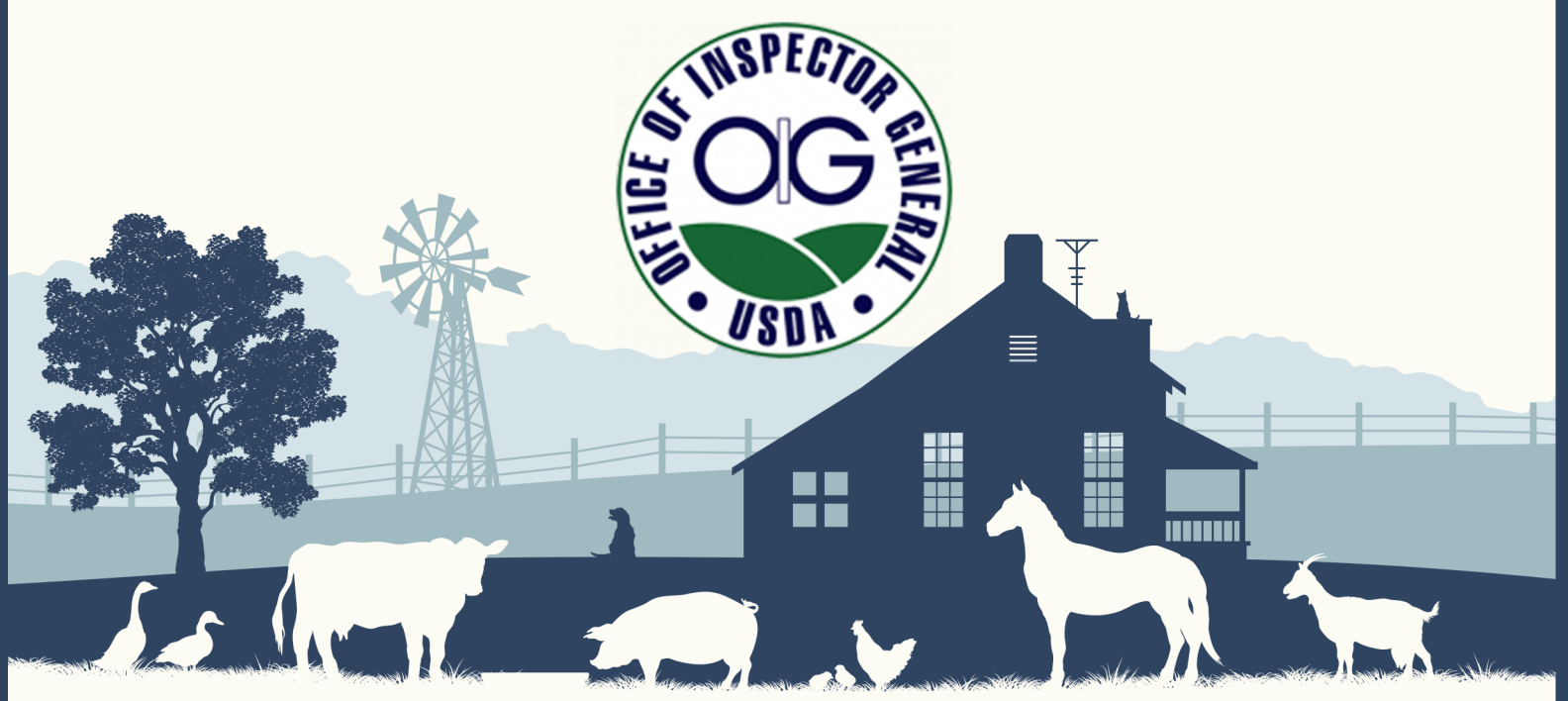
They do not depict any particular audit, inspection, or investigation.