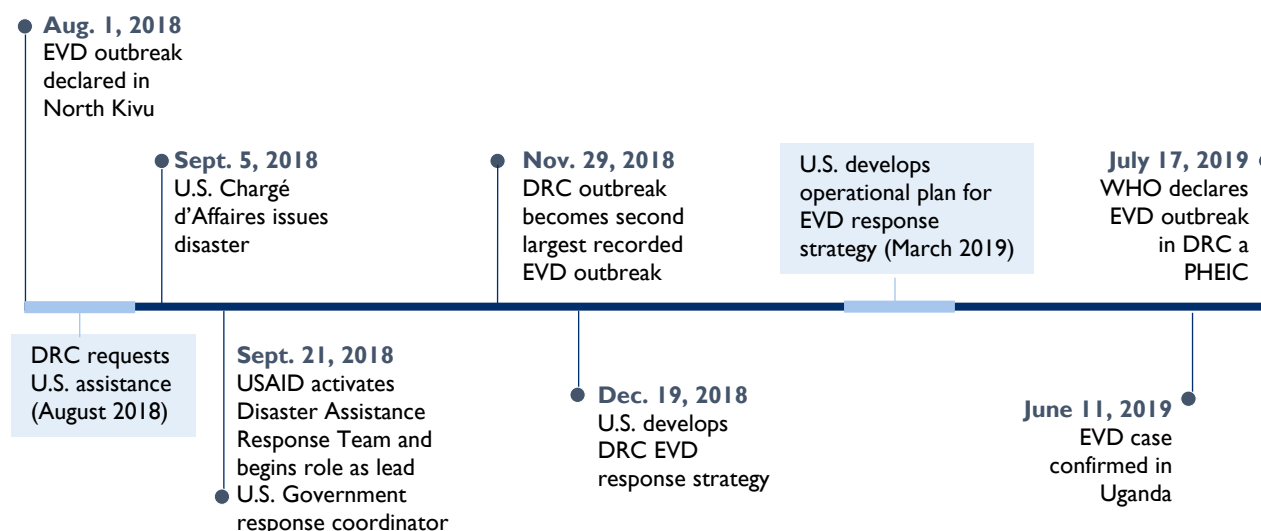
Figure 2: Timeline of Key Events in USAID Response to DRC EVD Outbreak

In line with this assessment, our audit of USAID’s past response to the EVD outbreak in West Africa reported that coordination challenges internally and with key stakeholders hampered operational effectiveness. USAID has made some progress in closing the coordination gap in responding to international public health crises since that time. For example, in 2018 the Agency issued an internal notice outlining the Agency’s operational and programmatic response in coordinating with U.S. Government agencies and international partners for different outbreak scenarios. In accordance with the notice and outbreak scenario, the Bureau for Global Health (Global Health) took the lead for USAID actions related to the EVD outbreak in DRC until September 21, 2018, after a disaster declaration was issued and OFDA took the lead for USAID and the U.S. Government (see figure 2).