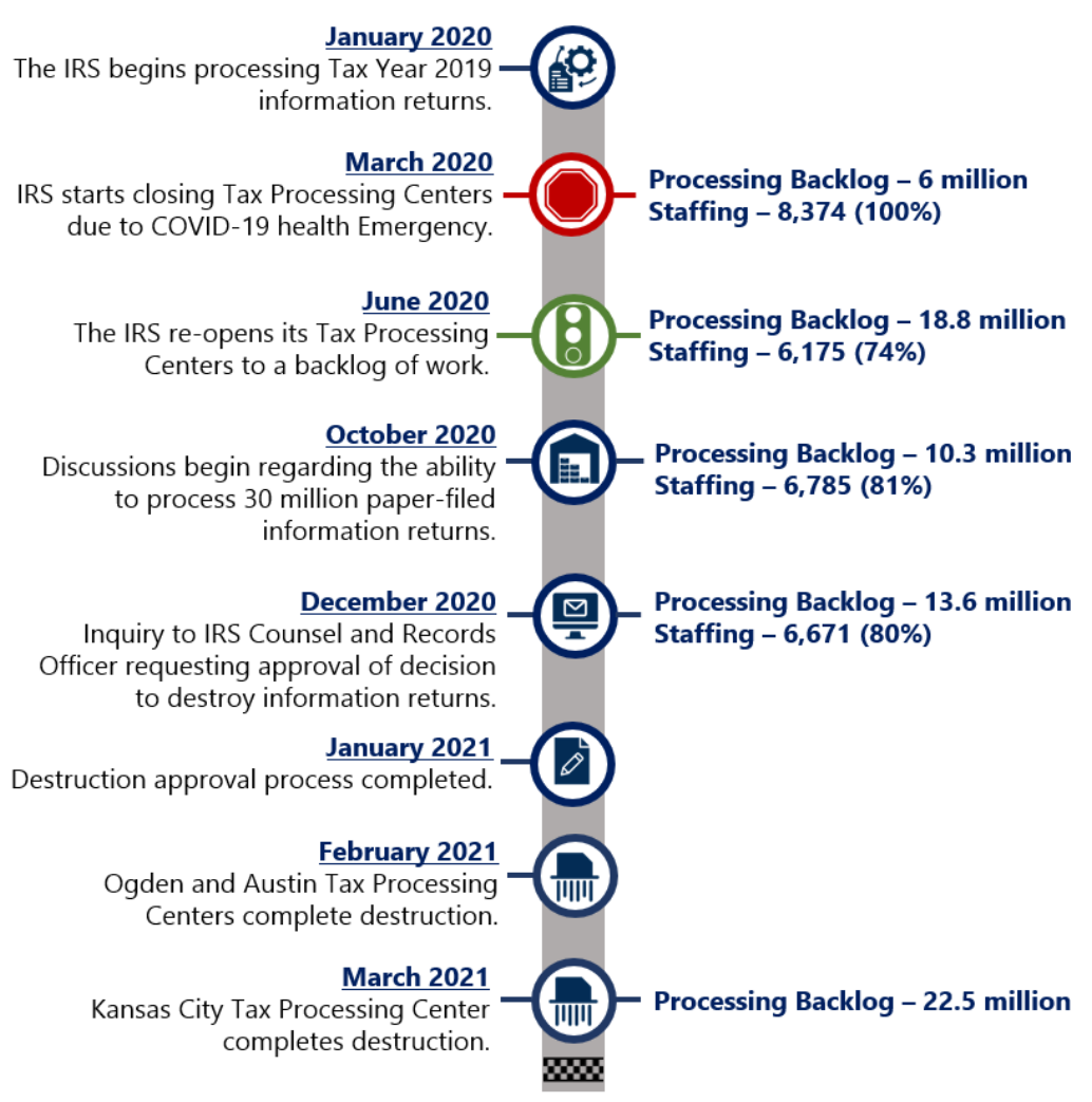
Figure 4: Timeline of the Decision to Destroy Unprocessed Paper-Filed Information Returns<sup>9</sup>