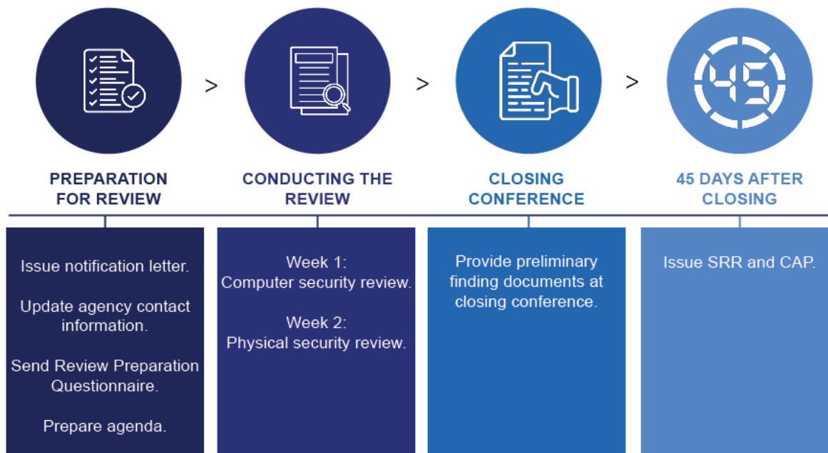
Figure 2: Safeguard Review Process