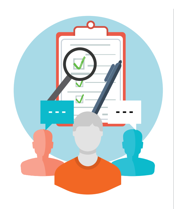
REITERATE EXISTING POLICY

to ensure proper review, approval, and documentation of labor substitution for key personnel. Finally, we recommended management revise existing policy to clarify requirements for requesting and approving key personnel labor substitution.