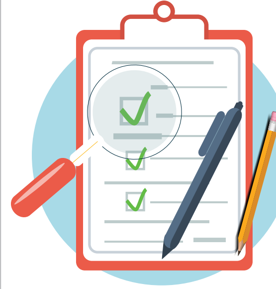
ESTABLISH AN OVERSIGHT PROCESS