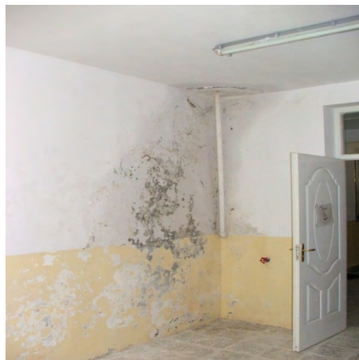
Photo 2 - Leaky Roof Damages Ceilings and Walls