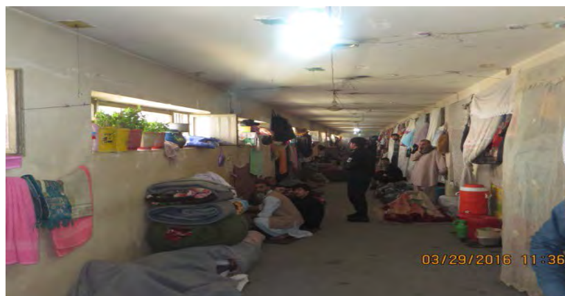
Photo 2 - Overcrowded Conditions with Inmates Living in Hallways

During our March through April 2016 site visits, we found that the prison was still overcrowded and inmates were still living in the hallways, as shown in photo 2. However, the overcrowding would have even been worse had it not been for action the Afghan General Directorate of Prisons and Detention Centers took to transfer some high-threat inmates from the prison to more secure facilities. According to INL officials, in 2016, the directorate transferred more than 2,700 inmates from Pol-i-Charkhi to a high-security prison in Bagram. In January 2017, a directorate official told us Pol-i-Charkhi prison now holds between 9,500 and 10,000 inmates—almost double its capacity.