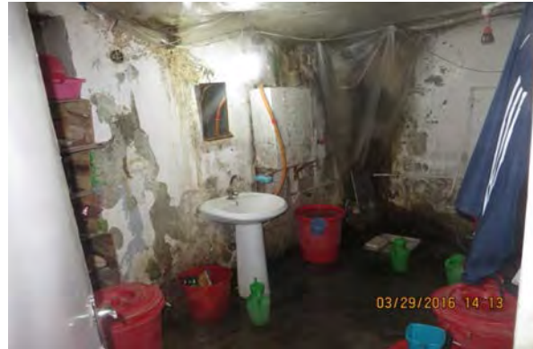
Photo 4 - Poorly Maintained Bathroom in Block 3