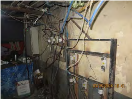
Photo 3 - Poorly Maintained Electrical Panel Board in Block 2 Office Building

In October 2014, we reported that Pol-i-Charkhi prison had been relatively well maintained. However, during our March through April 2016 site visits, we found that it was suffering from poor maintenance. For example, the electrical fixtures that AWCC installed were broken, inoperable, or missing throughout the prison, including the guard shack and gate house. Electrical panel boards were poorly maintained, and plumbing fixtures, such as toilets, sinks, showerheads, floor drains, and water/sewer pipes, were broken or inoperable, as shown in photos 3 and 4. Further, we found that the security entrance/exit vehicle drop arm was broken and lying on the ground. Appendix III lists the nine maintenance issues we identified.