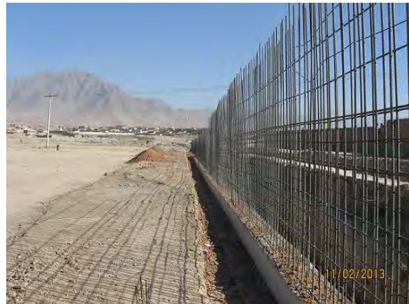
Photo 2 - Perimeter Wall Foundation and Reinforcing Steel