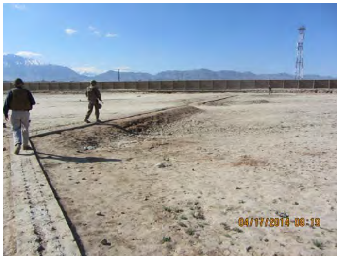
Photo 1 - ANA Slaughterhouse Construction Site in Pol-i-Charkhi in Kabul Province

Quality Standards for Inspection and Evaluation , published by the Council of the Inspectors General for Integrity and Efficiency. The engineering assessment was conducted by a professional engineer in accordance with the National Society of Professional Engineers’ Code of Ethics for Engineers . Appendix I contains a more detailed discussion of our scope and methodology.