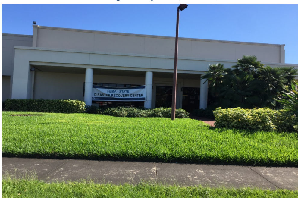
DRC - Orange County Bank, Orlando, FL