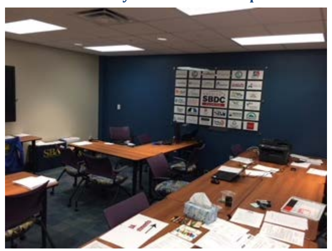
BRC -The EpiCenter-Pinellas County Economic Development Center, Clearwater, FL